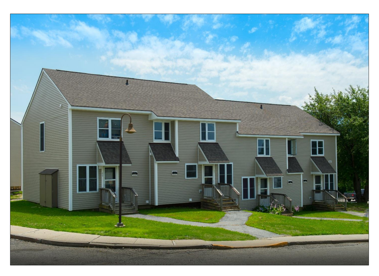
Applegate Apartments \cdot 104 apartments \cdot Bennington, Vermont