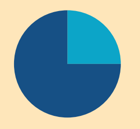
STEM jobs comprise 25% of all employment in Vermont.

In Vermont, technology jobs are growing, but the workforce is retiring, forcing employers to import the talent they need.