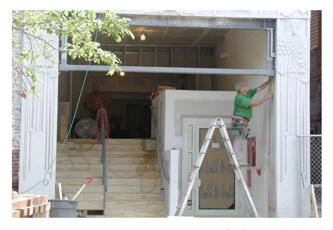
The construction process went along very slowly, but we finally opened the theater on 7/15/11, almost three years to the date after the fire. In addition, we created nine beautiful one bedroom apartments that were totally occupied by 12/31/11.