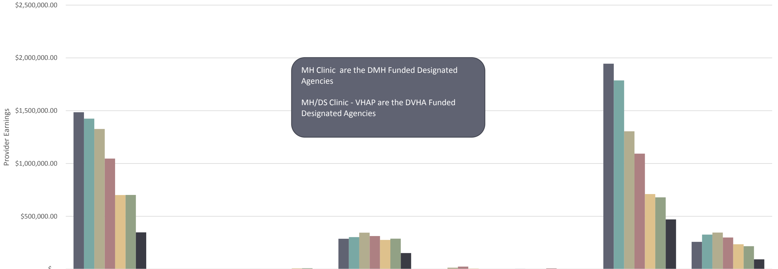
90853 Distribution By Provider Type for each Fiscal Year since 2010