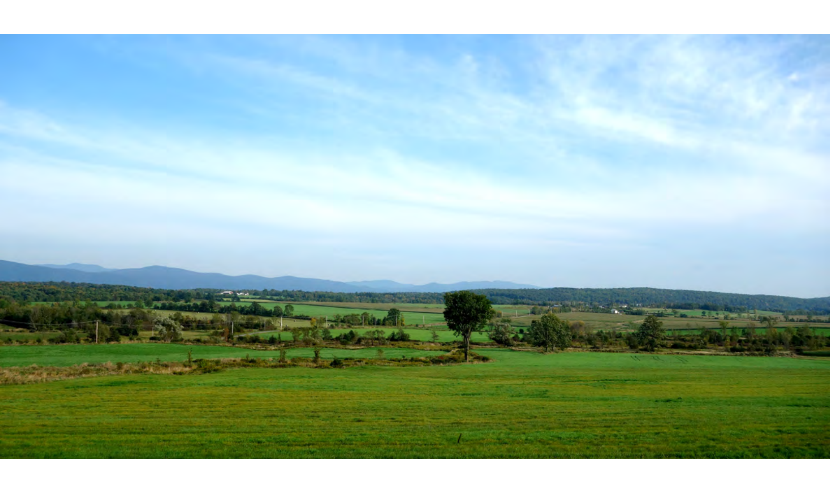
Report Prepared by The Executive Branch Working Group October 20, 2017