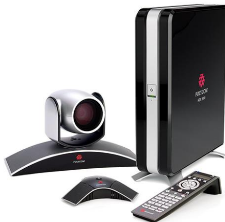
Polycom HDX Video systems