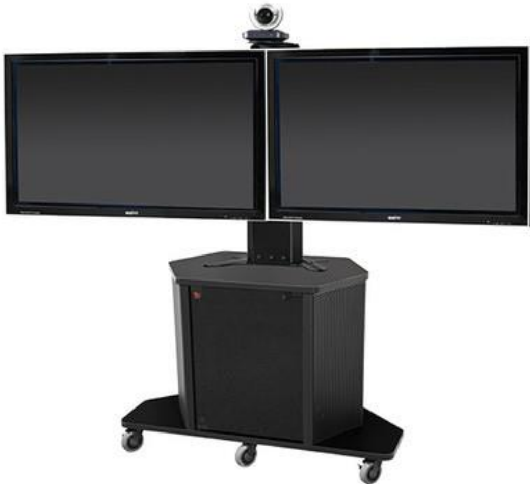
Rolling Carts Dual-Monitor