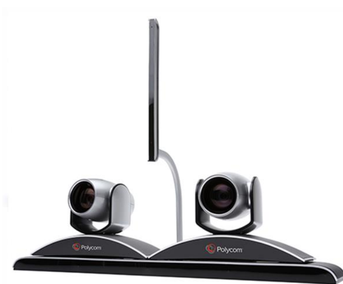
EagleEye Director Auto-follow camera system