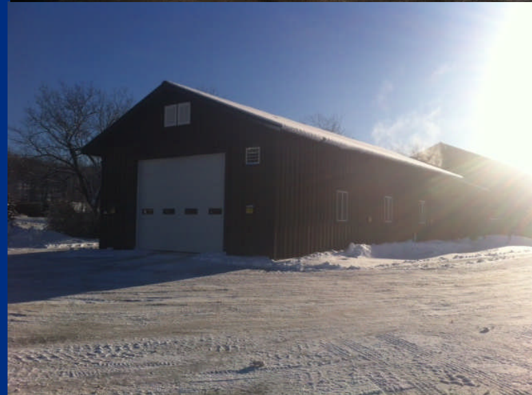
Examples of free-standing storage buildings (tempered heat)