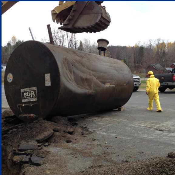
Removal of old tank