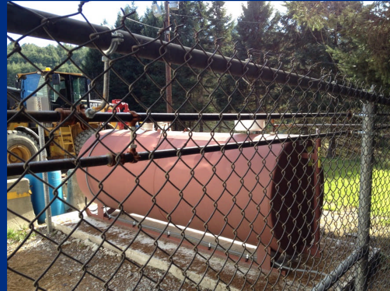
New above-ground tank

$75,000 expended in FY2015 to date on removal/replacement of underground tanks