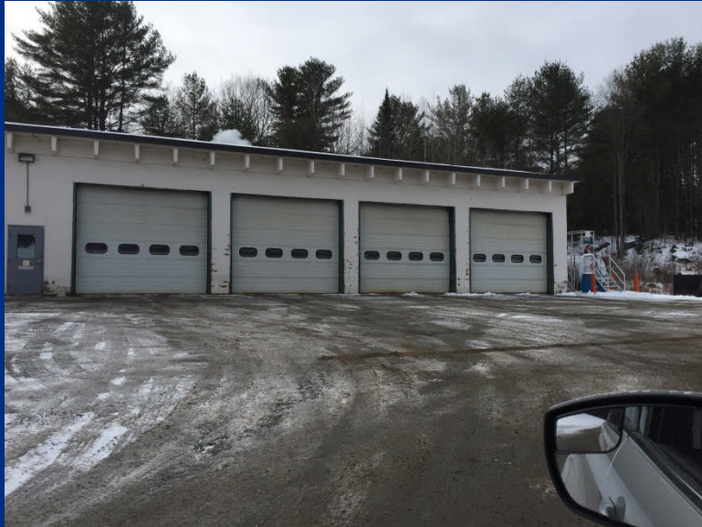
Existing garage (Boltonville)