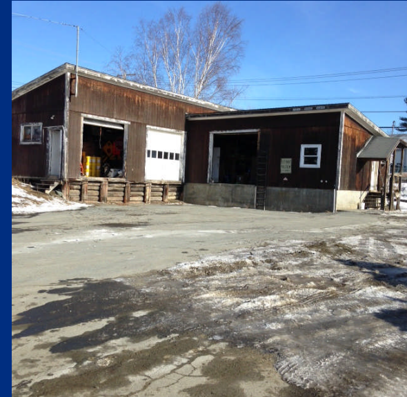
Store keepers office and cold storage (existing)