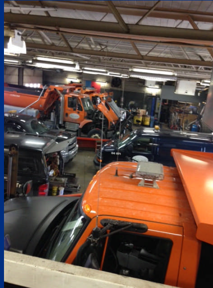
Mechanics working in garage area.