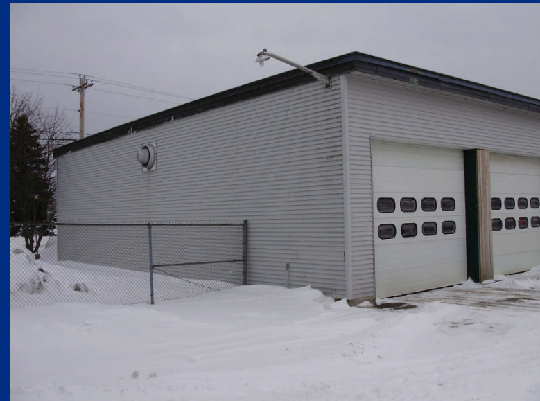
Example of 1-bay addition (Morrisville)