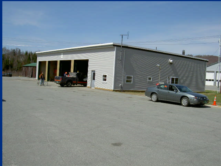
Existing Enosburg Garage

Need: 1-bay tempered heat storage space for equipment