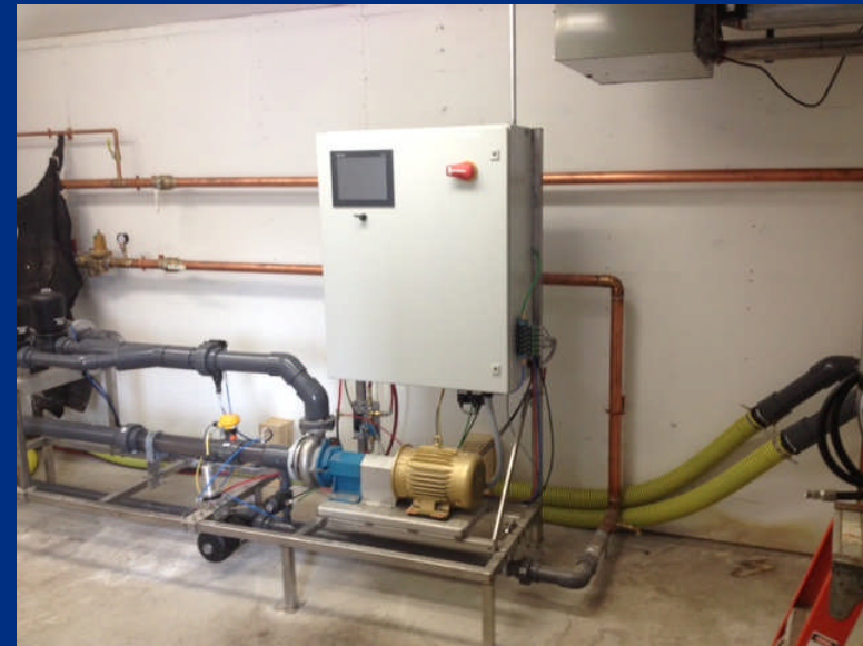
East Dorset Garage Brine Facility