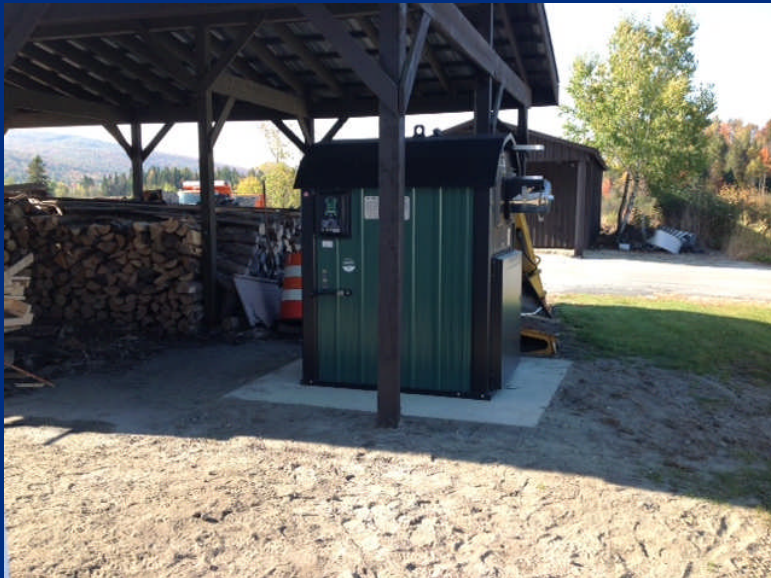
Island Pond Garage outdoor wood boiler ($85,000)