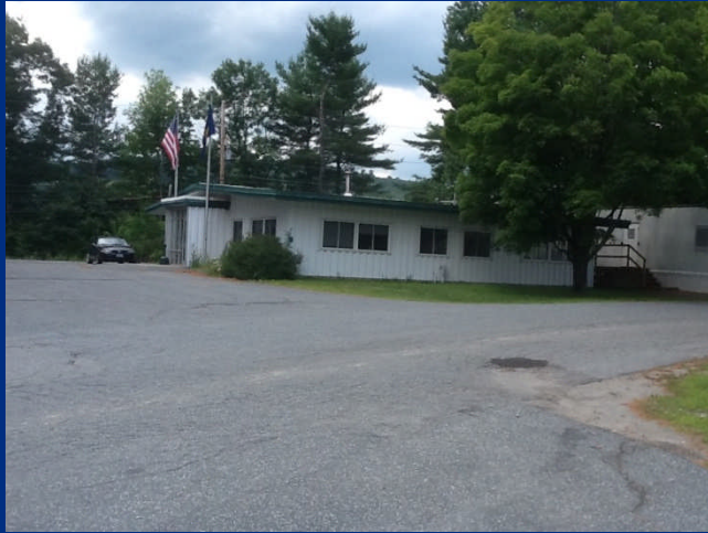
Office Building (existing)