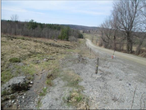
BEFORE – Unstable road and ditch.

This project was previously identified as an eroding gravel road and ditch in an ERP-funded Stormwater Master Plan for Franklin County. The Missisquoi River Basin Association (MRBA) championed this project, which involved removing a roadside berm that was blocking a ditch, rock-lining eroding ditches and outlets, and fencing to keep livestock out of the ditch.