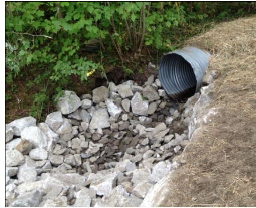
AFTER – Stone-lined settling pool and outfall below culvert, allowing sediment to settle out before discharging into Lake Seymour.