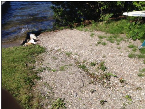
BEFORE – Erosion at community access path at Lake Dunmore.

The Federation of Vermont Lakes and Ponds teamed up with the Town of Salisbury, Vermont Youth Conservation Corps and VTDEC LakeWise Program to stabilize an eroding public access path to Lake Dunmore.