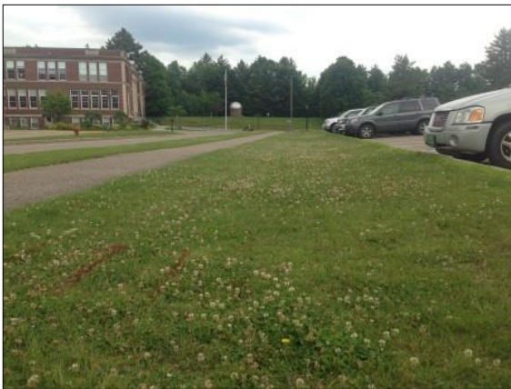
BEFORE – School parking area.

http://vtwatershedblog.com/2014/11/20/ideas-become-a-reality