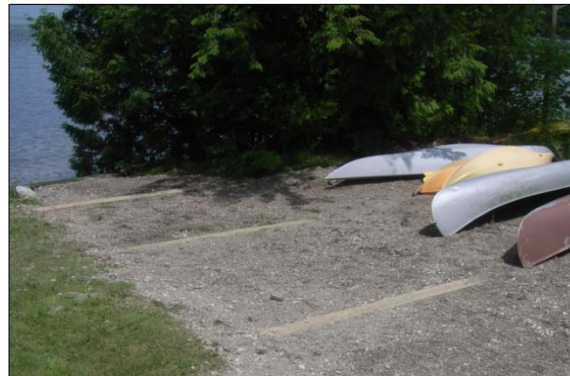
BEFORE – Stabilization of access path.