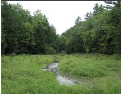
BEFORE – Mill pond behind dam filled with accumulated sediment.

The removal of an old (circa 1870) ice pond dam restored 10 square miles of stream habitat in Rutland County. More information may be found at the VTDEC blog: http://vtwatershedblog.com/2014/12/10/kendrick-dam-removal-project-completed/