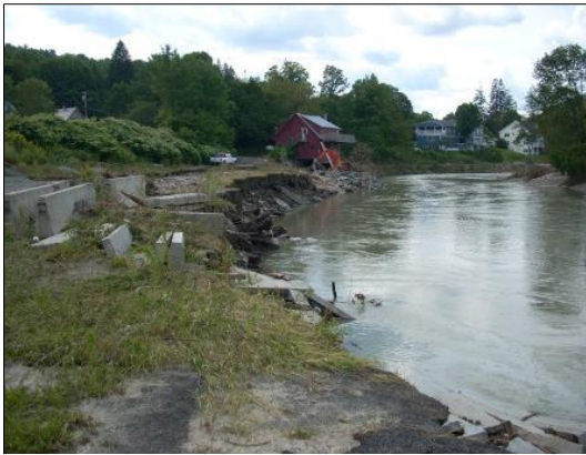
BEFORE – Eroding and degraded floodplain, Ottauquechee River.

The Village of Woodstock restored the floodplain at land formerly used as the town snow dump, to create the new Woodstock Community Riverfront Park. The project installed green stormwater infrastructure called rain gardens and a vegetated buffer to filter stormwater runoff before it reaches the Ottauquechee River. The park supports public access to the Ottauquechee River for boating or swimming. Refer to the VTDEC blog for more information: http://vtwatershedblog.com/2014/12/17/woodstock-community-riverfront-park-completed/