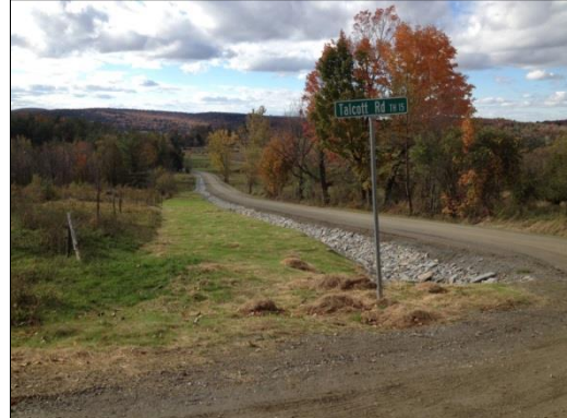
AFTER – Stabilization of eroding road and ditch and livestock exclusion with fencing.