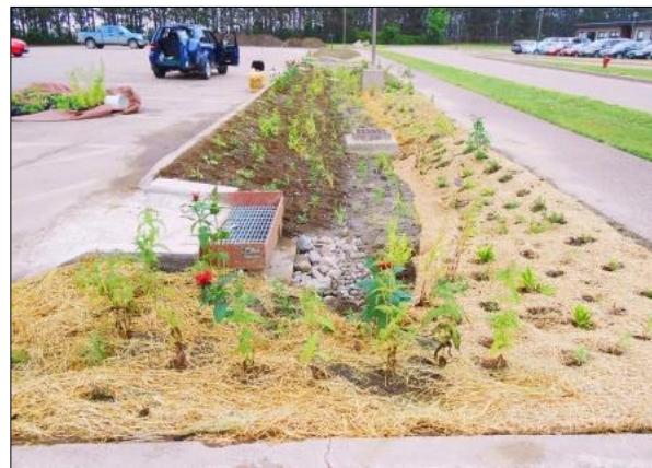
AFTER – School parking area after installation of bioretention system.