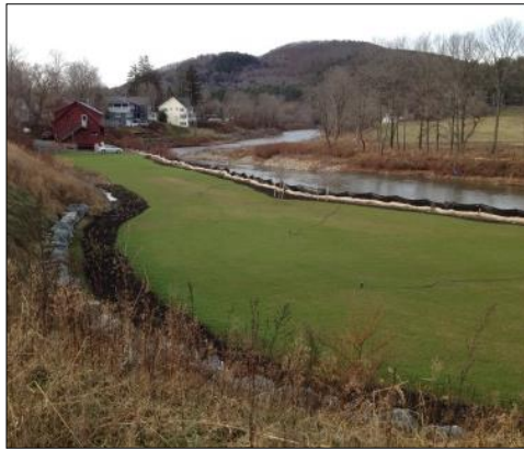
AFTER – Restored floodplain, Ottauquechee River.