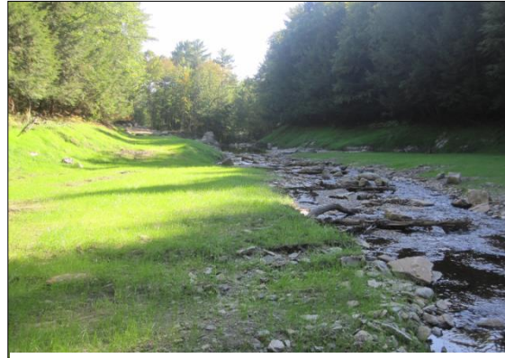
AFTER – Free-flowing Sugar Hollow Brook.