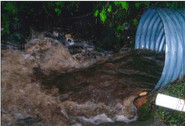
BEFORE – Sediment-laden water discharging to Lake Seymour.

The Town of Morgan secured ERP funds via the VTans Vermont Better Back Roads program to mitigate sediment and erosion problems along Waysees Road, a private road, that were causing water quality impacts to Lake Seymour. The project involved stone-lining a settling pool below the road culvert outfall and controlling runoff from a steep hillside above the culvert.