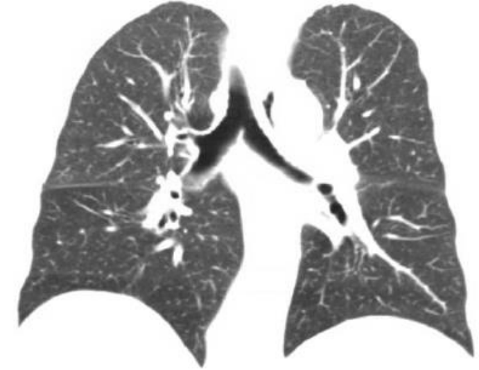
3 days later, feeling better

Atkins G, Drescher F. Chest. 2015;148(4_MeetingAbstracts):83A