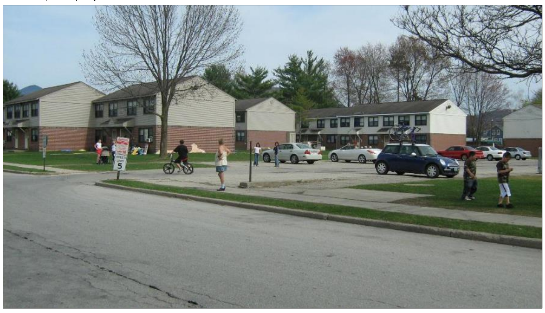
Forest Park (Rutland) - before construction