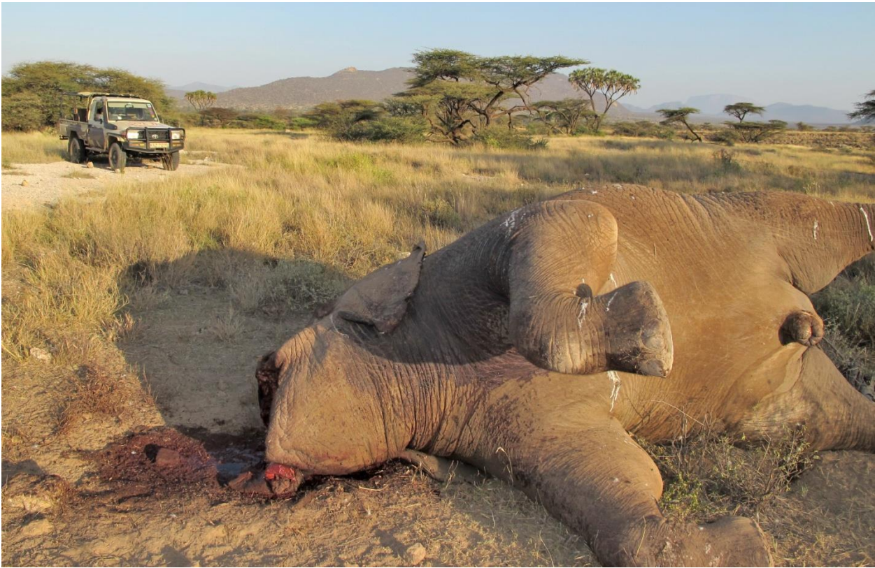
Philo Corpse Philo, five days later. He was shot by poachers and left to rot, his tusks hacked off.