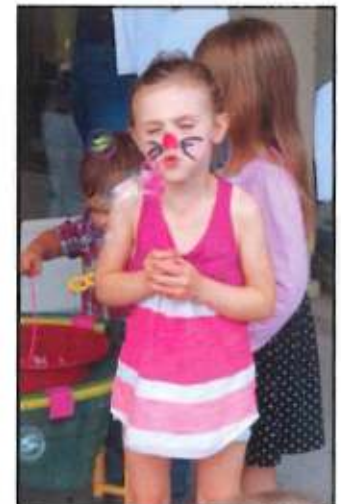
Tye Dying, Face Painting, Bubble Blowing, Play Doh, Sand tables, Pizza, classroom fun and so much more!