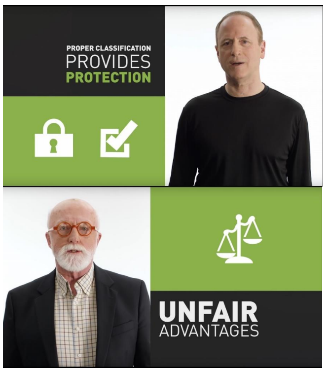
Below is the script for the commercial:

"Workers who are misclassified by their employers as independent contractors instead of as employees is a problem in Vermont.