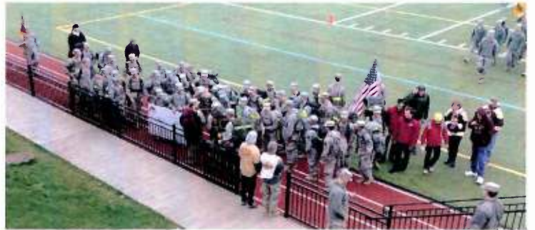
Norwich University Annual Legacy March and Presentation of Donation to The Veterans' Place