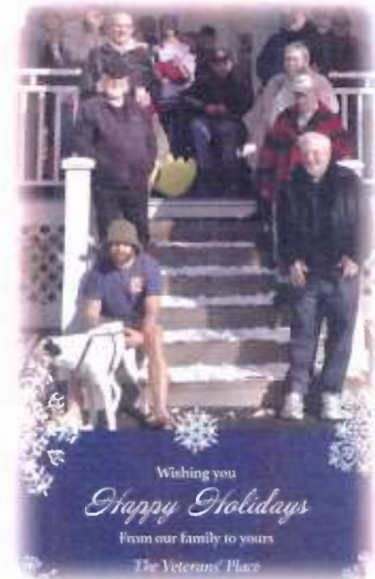
From our house to yours!

Please make donations payable to: The Veterans' Place, Inc., 220 Vine Street, Northfield, VT 05663 and enclose the following: