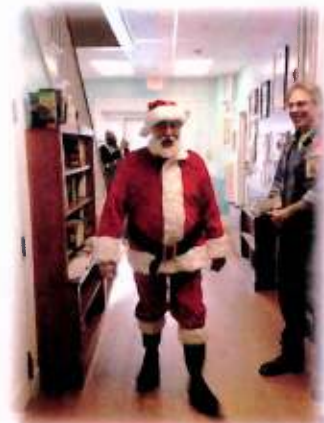
CVMA 26-2 Christmas visit