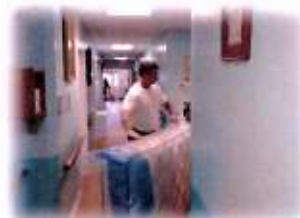
American Legion Department of Vermont Commander's Project - Replacement Mattresses (23 sets!)