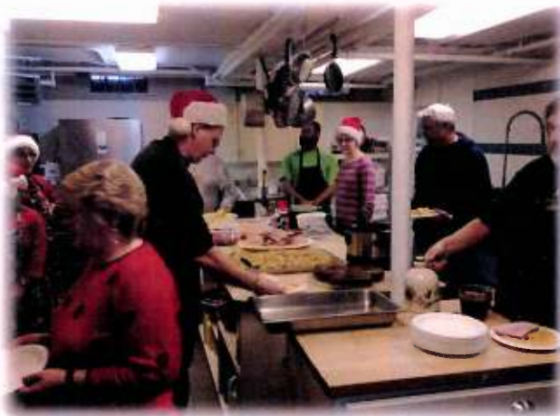
Christmas brunch celebration

We wish to thank all the many, many generous supporters, sponsors, volunteers, and visitors that have made our first five years a success. Your contributions have been priceless.