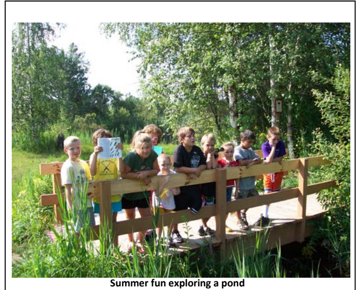
Summer fun exploring a pond