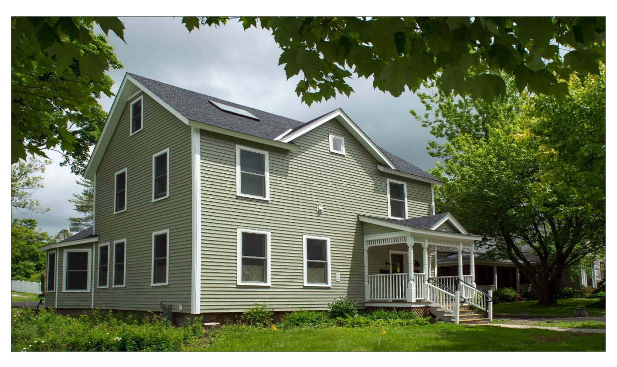
Rail City Apartments, St. Albans Scattered site renovations of 31 apartments