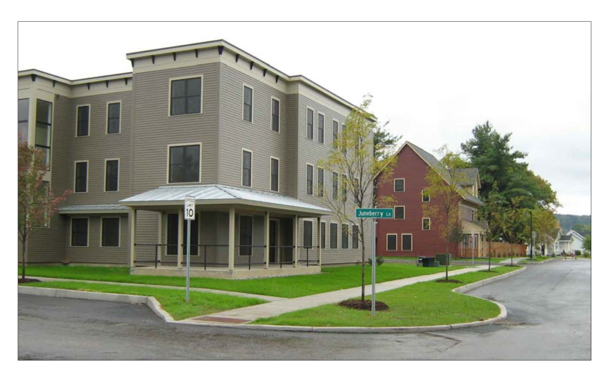
Hickory Street, Rutland Redevelopment of former Forest Park Public Housing 56 apartments and community space in two phases