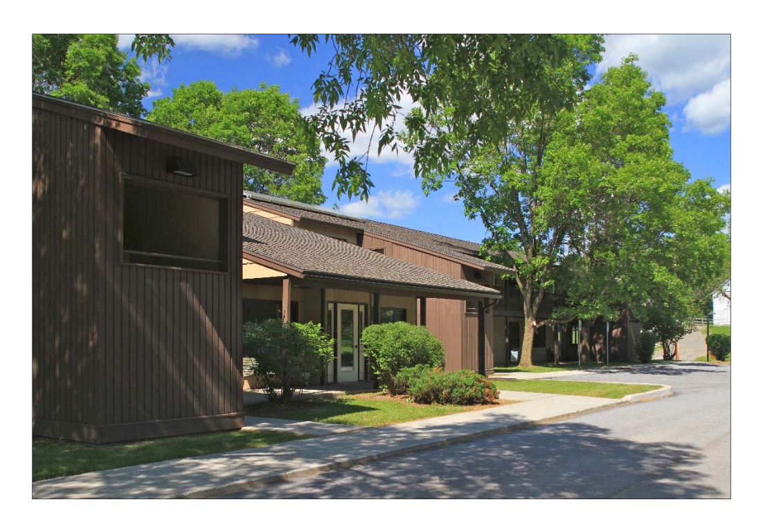
Missisquoi Manor, Richford 24rehabbed apartments with federal rental assistance for seniors