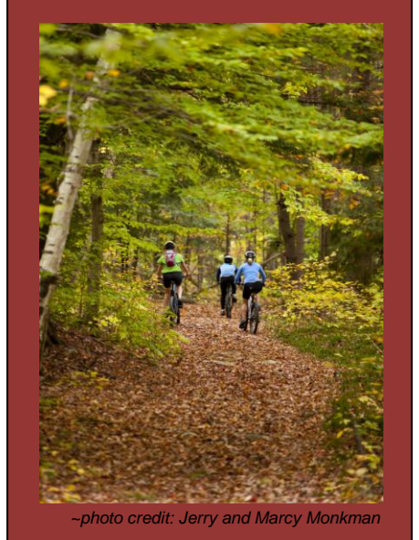
The Trust for Public Land worked with the Millstone Trails Association, Vermont Land Trust, and the Town of Barre to create a new community forest out of 355 acres of former quarry land. The Barre Town Forest is part of a 70mile trail network built by volunteers with the non-profit Millstone Trails Association. The trail network provides recreational opportunities for mountain bikers, cross country skiers, hikers, hunters, and snowmobilers. A recent economic analysis estimates that the Town Forest and trail system will result in an annual economic benefit of $640,000 from visitor spending and support 20 local jobs by 2015.