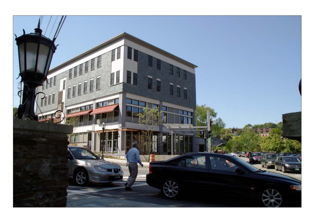
Canal and Main Apartments, Brattleboro 24 new construction apartments above the Brattleboro Food Co-op