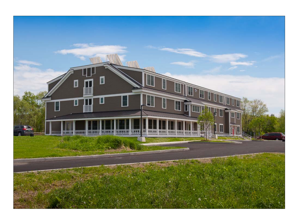
Armory Lane, Vergennes 25 new construction apartments for seniors