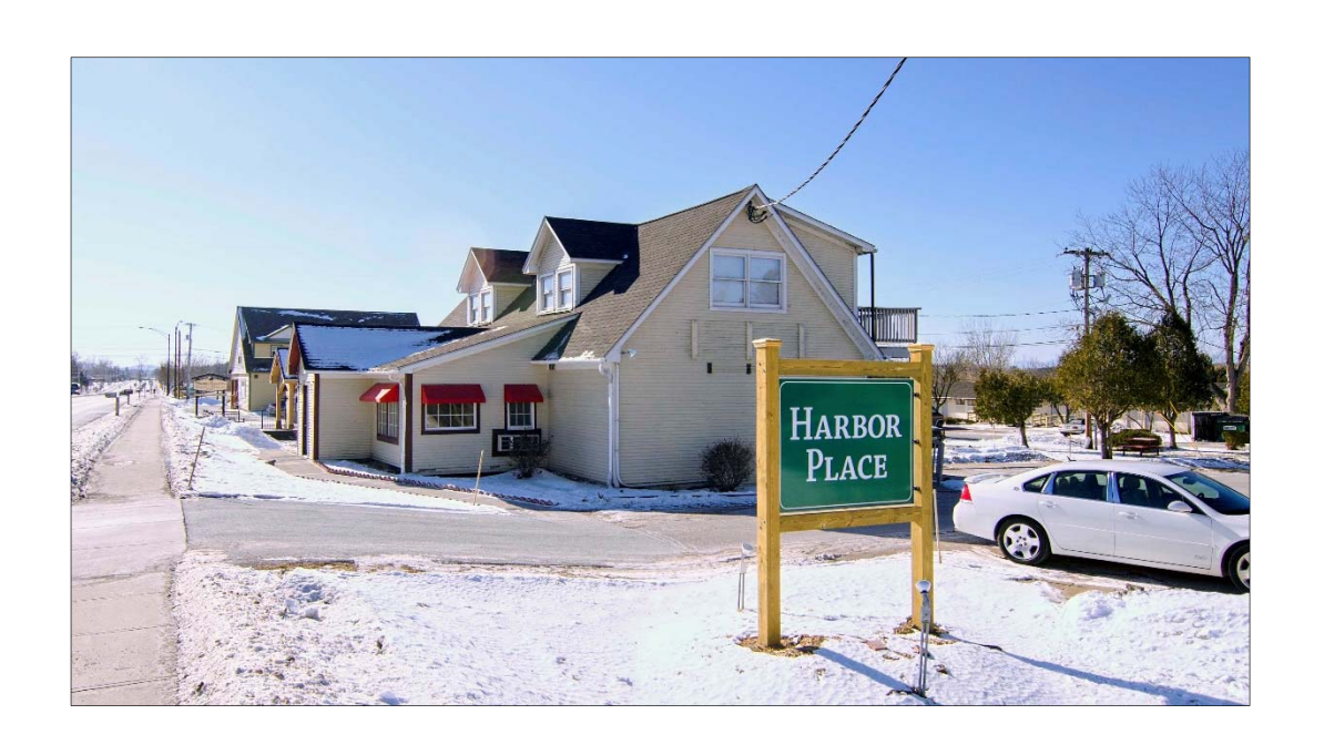
Harbor Place, South Burlington Champlain Housing Trust emergency housing with services