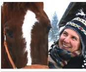
4-H & YOUTH