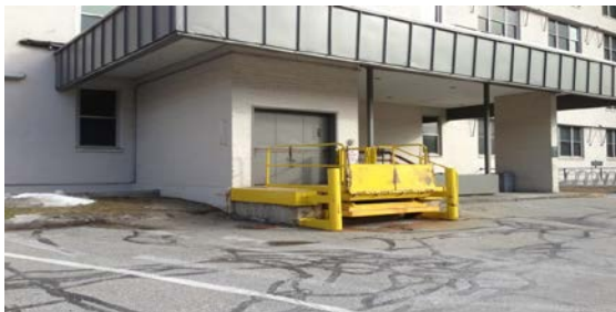
Previous Configuration of Loading Dock at 120 State St.