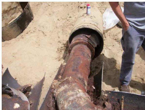
Corroded Direct-Buried Piping