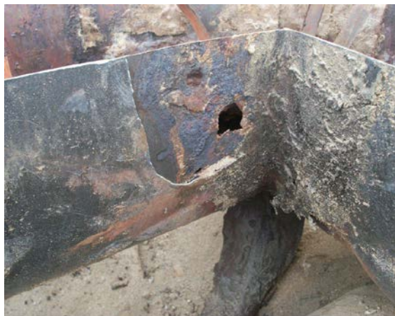
Closeup of Corroded Pipe