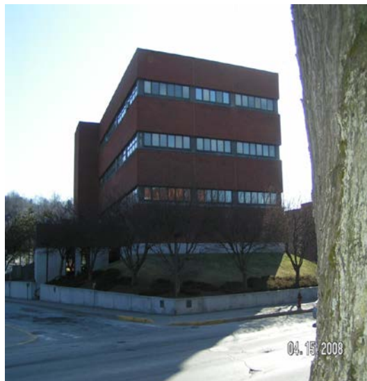
Front and Side Views of the Barre Court Building