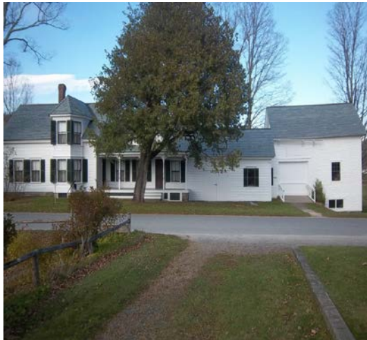
Misc. Painting - Coolidge Homestead, Plymouth