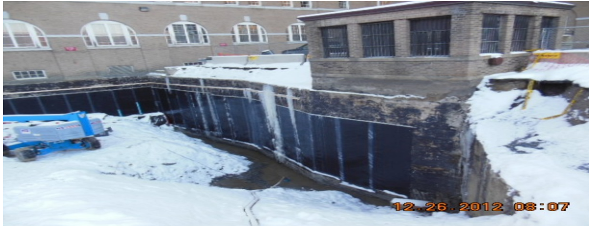
Exposed Foundation Waterproofing in Parking Lot at 133 State St.