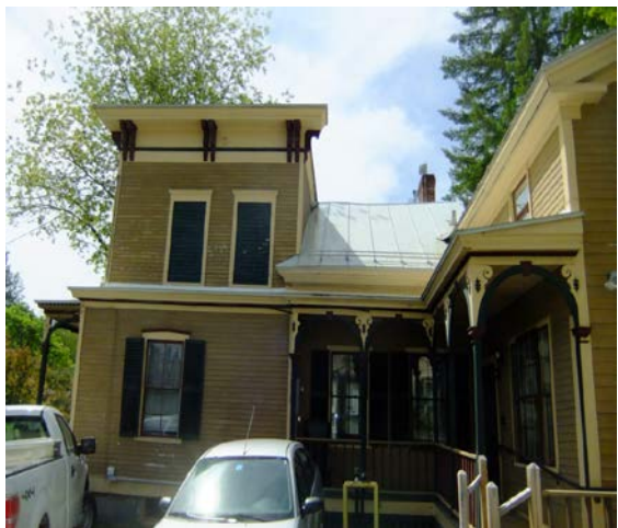
Side View of 13 Baldwin St.