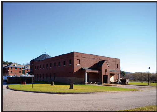
WATER RESOURCES & AGRICULTURE LAB