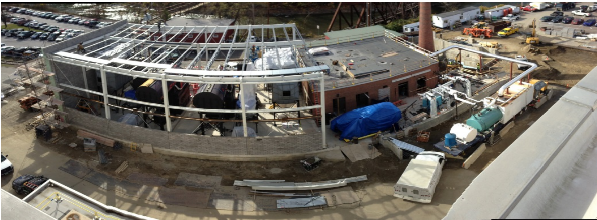
Panoramic View of the Heat Plant from the Roof of 120 State St.