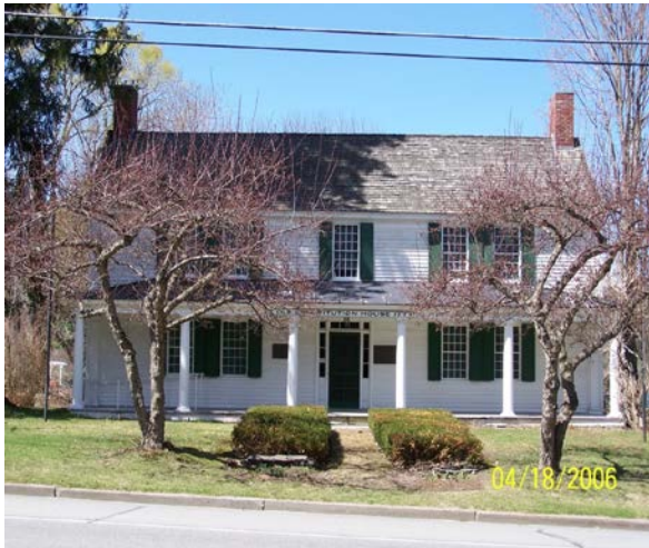
Reroof Project - Old Constitution House, Windsor