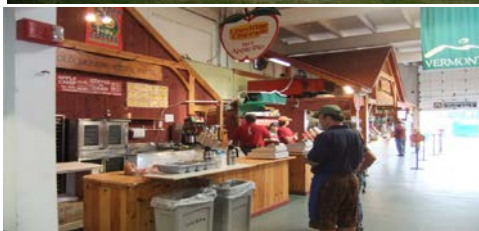
Cupola & Roof at the Vermont State Building "Big E"