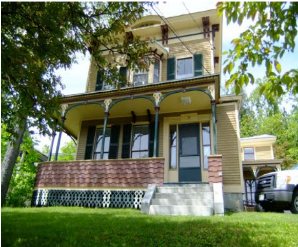
Front View of 13 Baldwin St.