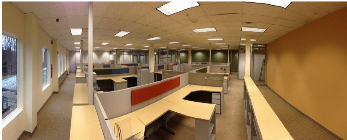
Open Office Concept Showing Workstations