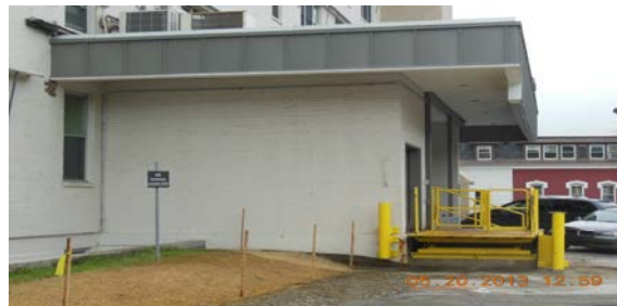
Modified Loading Dock and Soffit