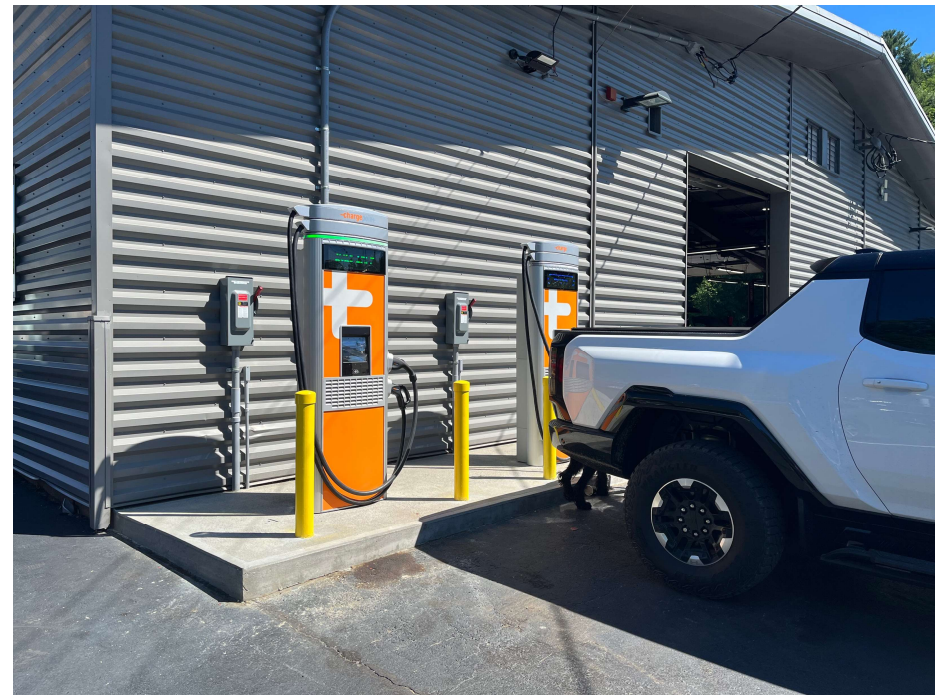
DCFC at an EEN EV Dealership