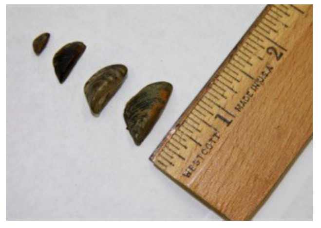
Mature Zebra Mussel development