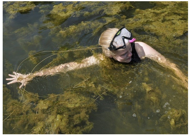
Swimming through Milfoil