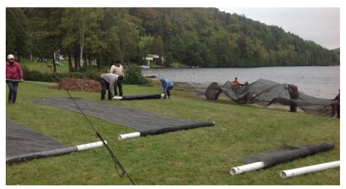
September, 2015: Shadow Lake removal of benthic mat for storage