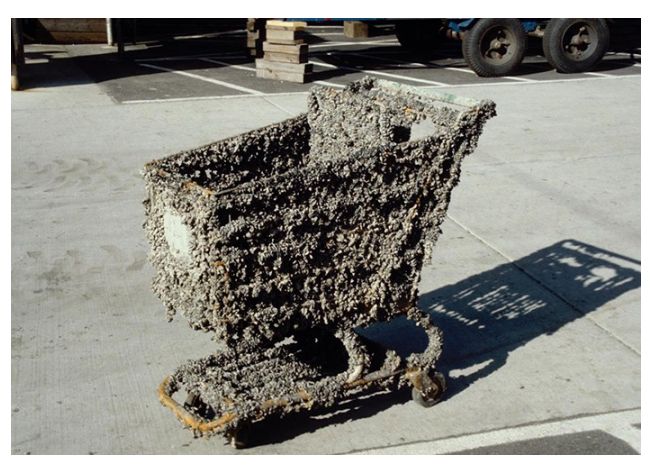
Zebra Mussel encrustation