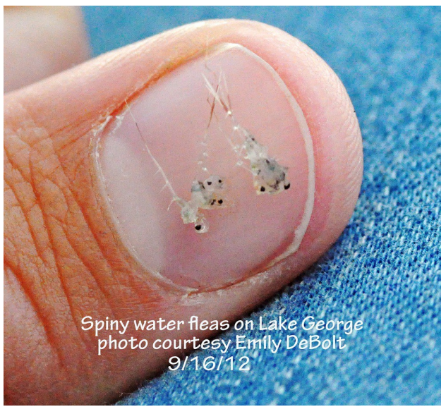
Spiny Water Flea