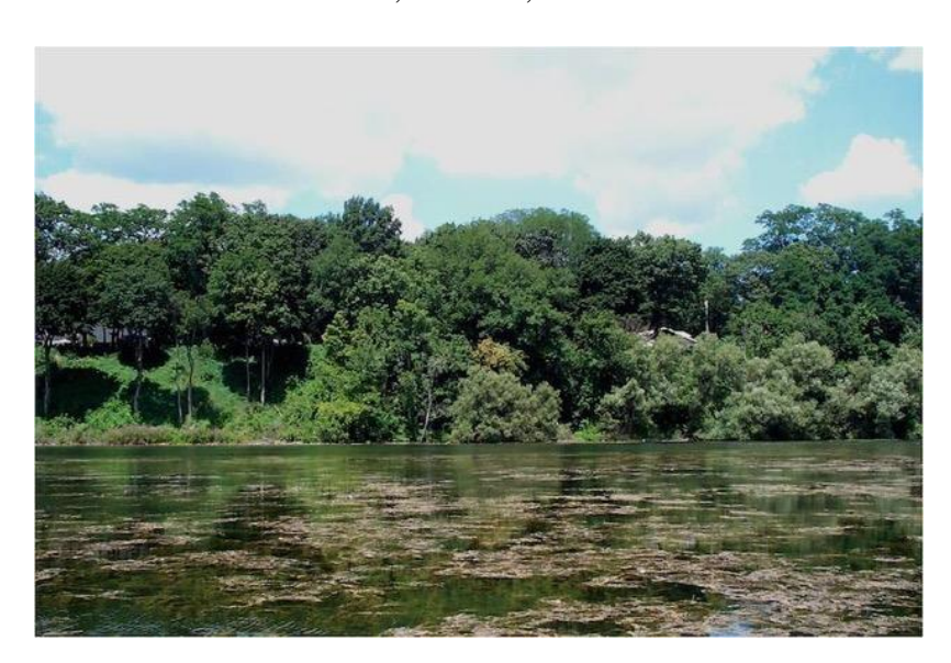
'Prevent, Protect, Preserve'

One of the principal missions of the Shadow Lake Association is to preserve and protect the healthy ecology of the lake by preventing the introduction of non-native aquatic invasive species, especially Eurasian water milfoil, and if introduced, seeking their eradication. To achieve this objective, the Association has established the Milfoil Committee, whose motto is;