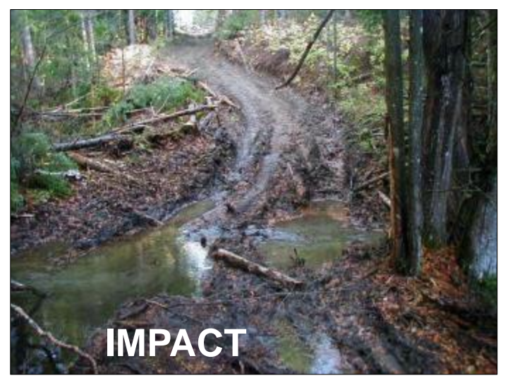
Unmanaged stream crossing at logging site