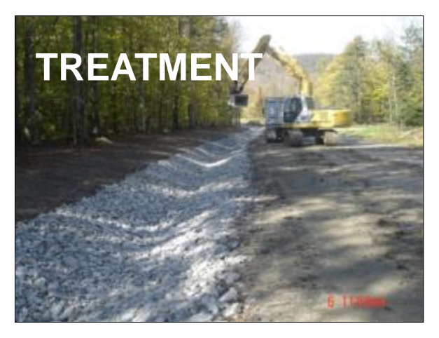
Ditch stabilization saves road and reduces erosion