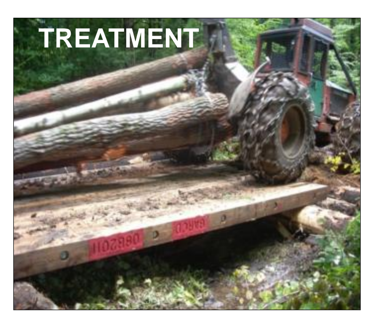
Temporary skidder bridge