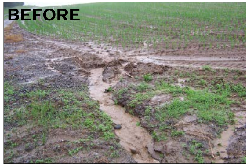
Gully formation & runoff on bare soils