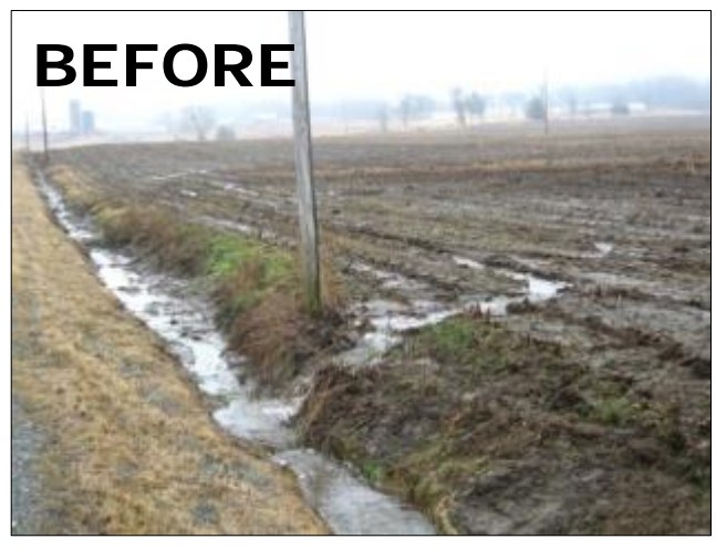
Runoff draining into ditch