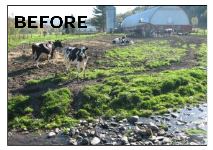
Uncontrolled livestock access to stream