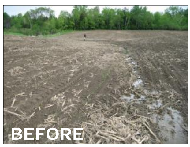
Gully erosion from concentrated water

Hay crop & buffer reduce erosion and phosphorus delivery to streams