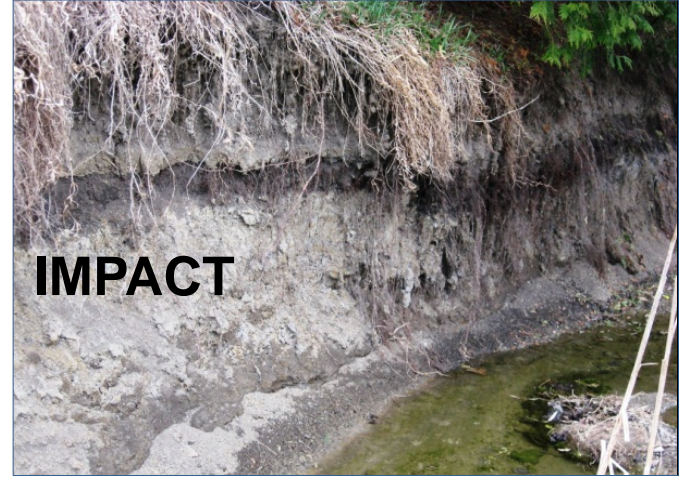
Streambank erosion from stormwater runoff