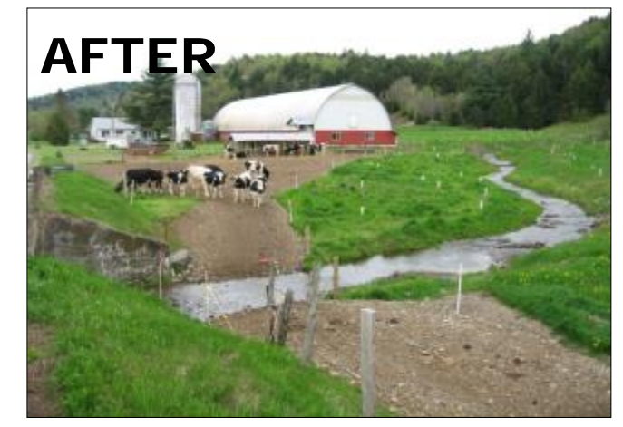
Installation of livestock fencing & buffer