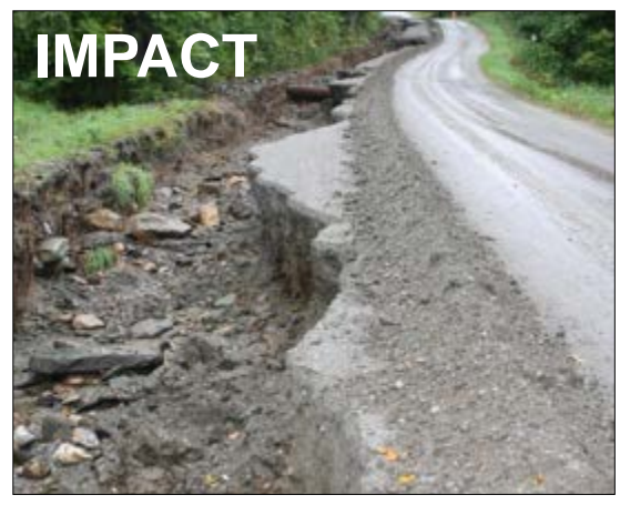
Eroding roadside ditch