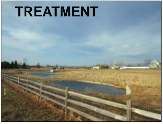
Stormwater treatment ponds