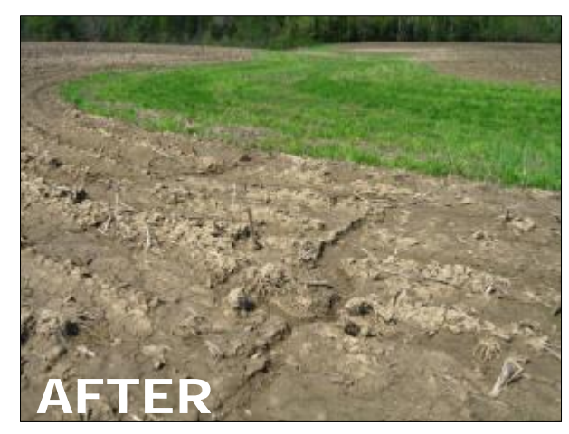
Grassed waterway to prevent gully formation