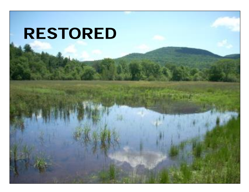
Restored wetland, former farmland