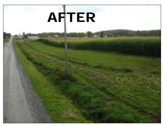
Vegetated buffer along ditch