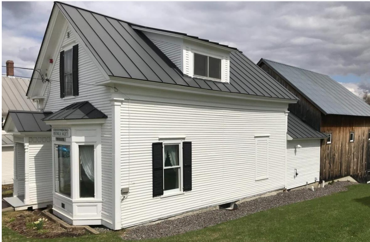
Greensboro Historical Society

Light protecting shades will make rotating displays more possible in the main exhibit space, creating a more suitable environment for exhibits that would feature more fragile archival materials and artifacts that currently are kept in our environmentally controlled storage. Community members and visitors may gain new insights and perspectives into their own family history and genealogy.