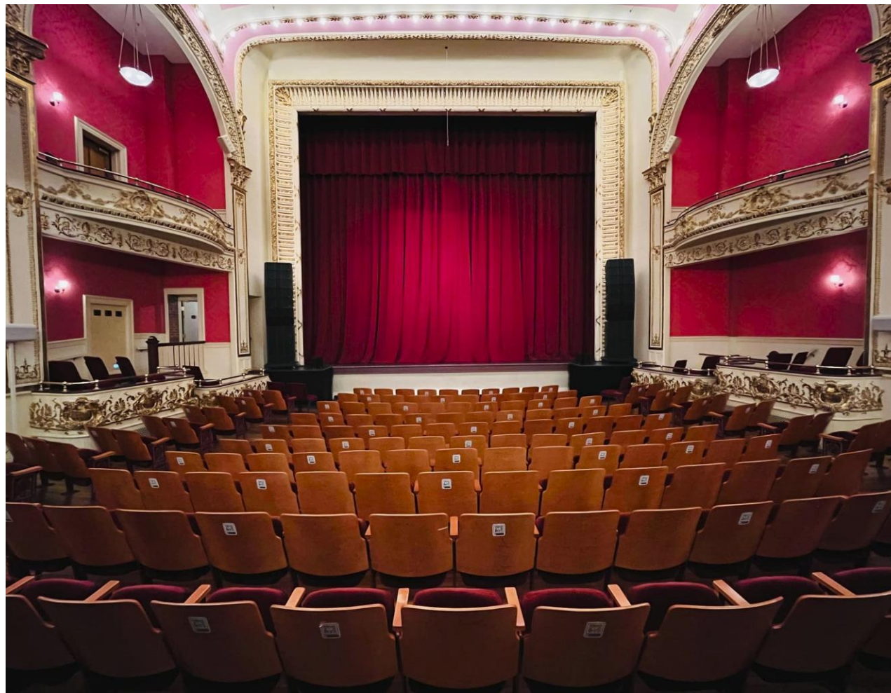
Paramount Center, Rutland

With support from this grant, we were able to increase our stage counterweight system by 35% and increased our ceiling height (by way of a new main curtain installation) by 30%. This investment will allow the organization to not only increase the variety of programming but to sustainably grow the quantity of such productions.