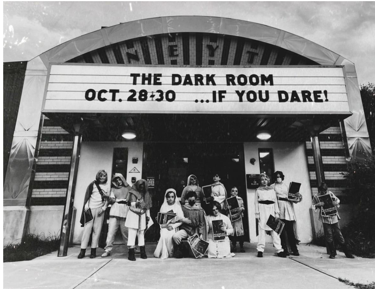
New England Youth Theater

This project is necessary to improve the safety and quality of NEYT's performance and education programming. Our new floor will mitigate tripping hazards while performing on stage or accessing seating. We know teaching, learning, and performing happen best with access to safe spaces and the appropriate tools. NEYT's theatre is the primary space where we work with groups of young people and host public audiences.