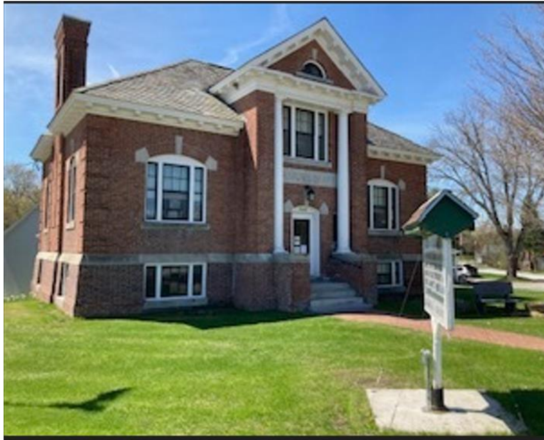
Haston Library, Franklin

The proposed project will improve the ADA access to the facility. Without the lift system access to the library is difficult at best and some patrons are not able to attend cultural events and happenings at the library due to access. The heating system will allow those using the facility to be comfortable while attending events and programs during the winter months.