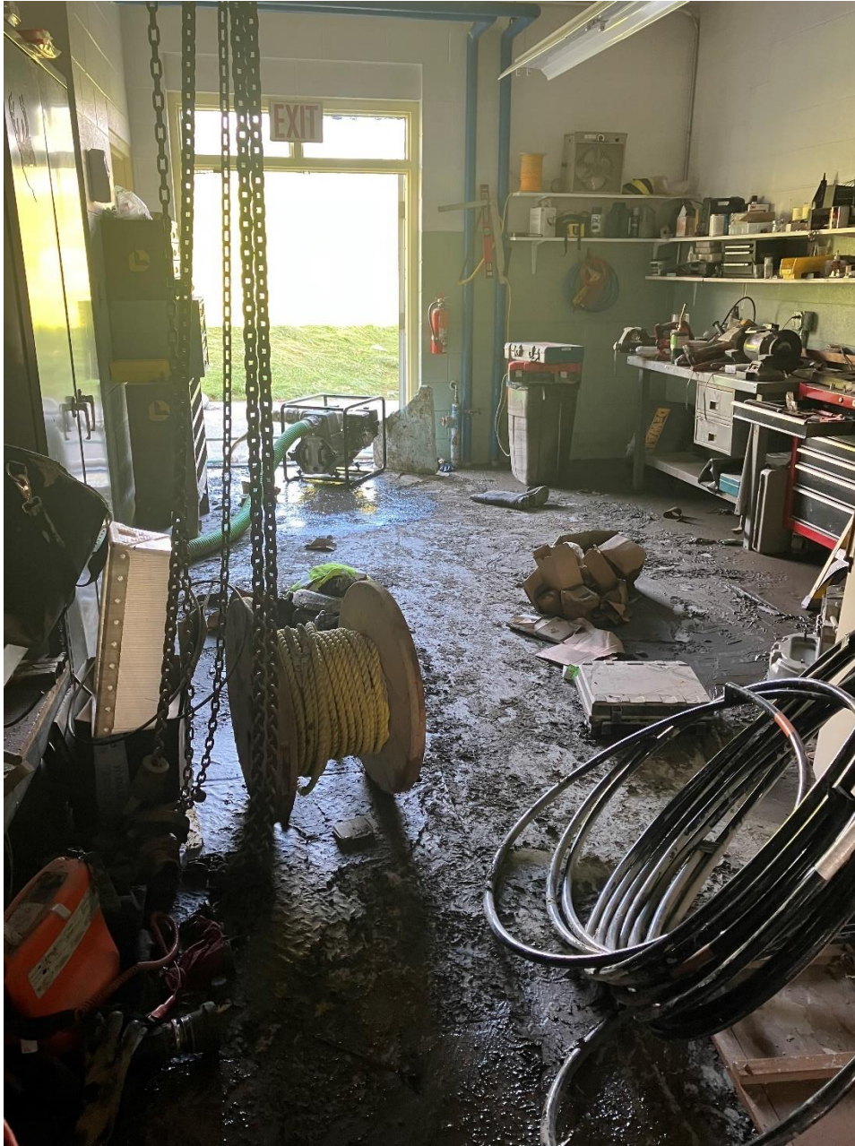
16- Maintenance Room Showing Portable Pump Pumping Out Basement Level