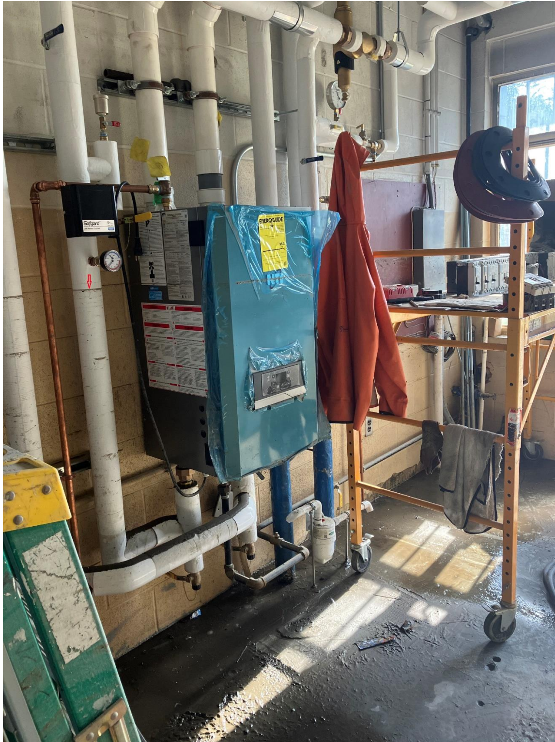
13- Boiler Room with High Water Mark