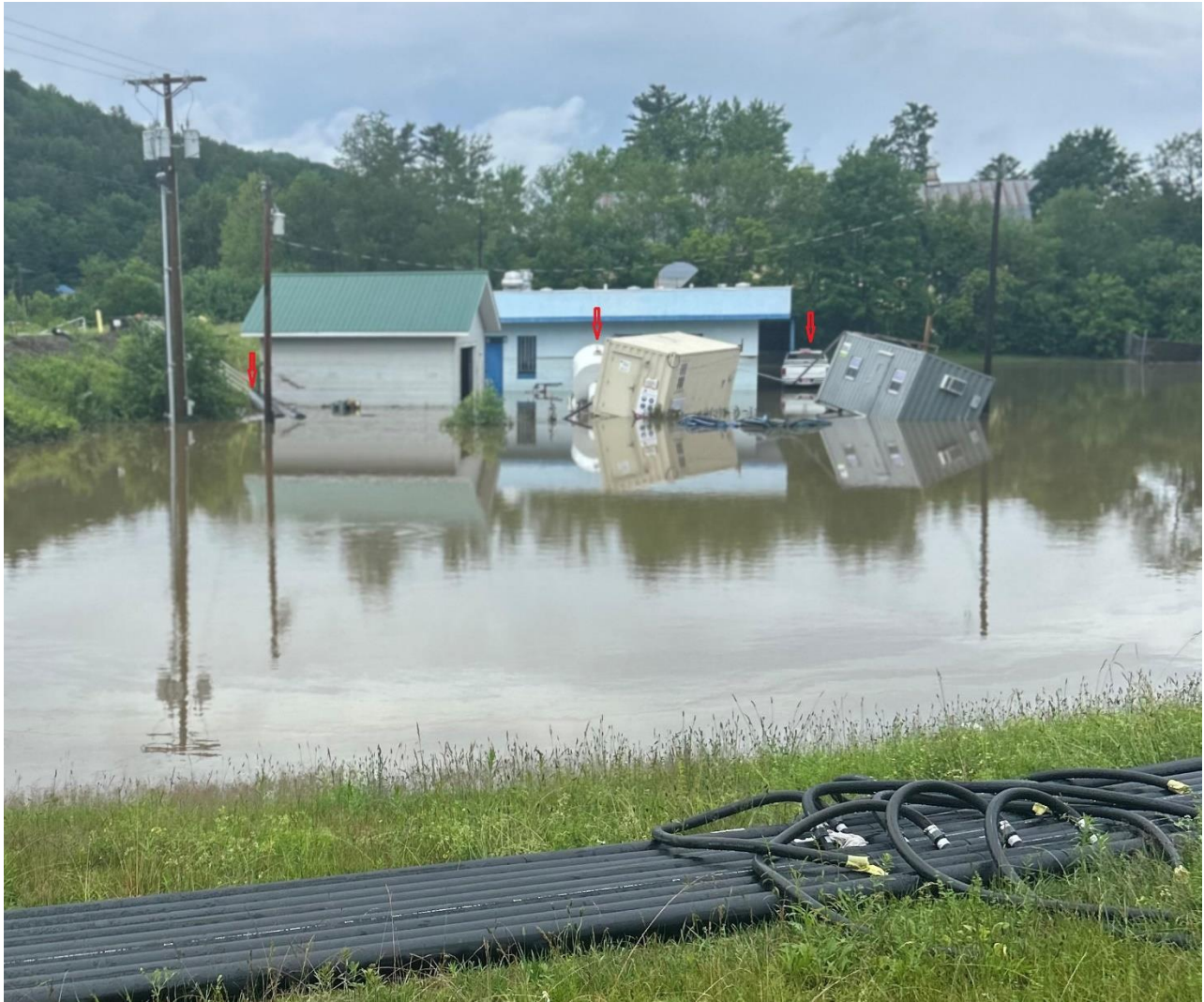
2- Receded Flood Waters at Main Plant, Note Two Rolls of Lagoon Liner Laid Against Stairs to the Lagoon Level, Sewer Rodder and Facility's Dodge Truck