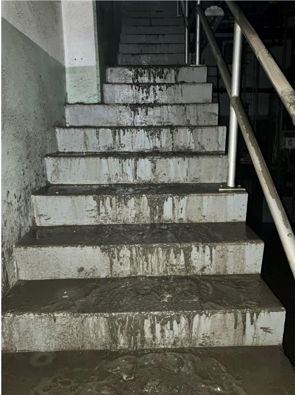
21- Basement Stairs