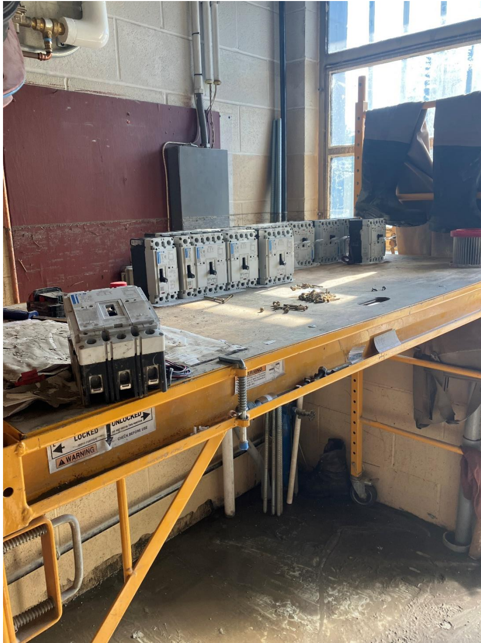
12- New Switches for Upgrade that were Submerged