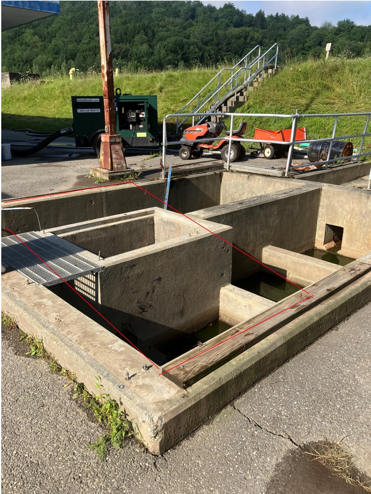
25- Plant Chlorine Contact Chamber with Approximate Location of Where A-Frame Structure Used to Sit