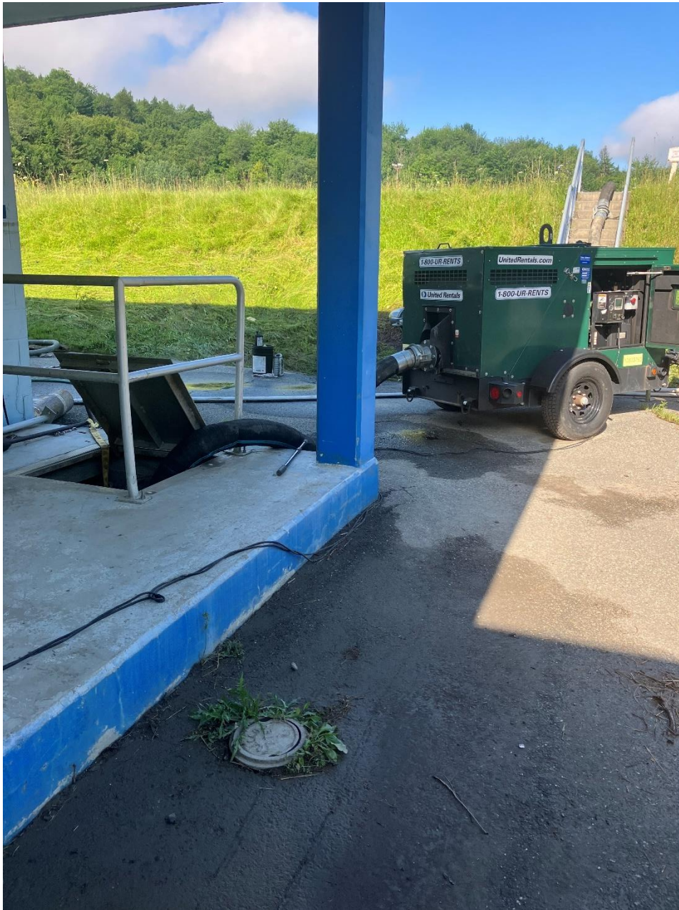
5- Portable Pump Pumping from Influent Wet Well to Lagoon 1