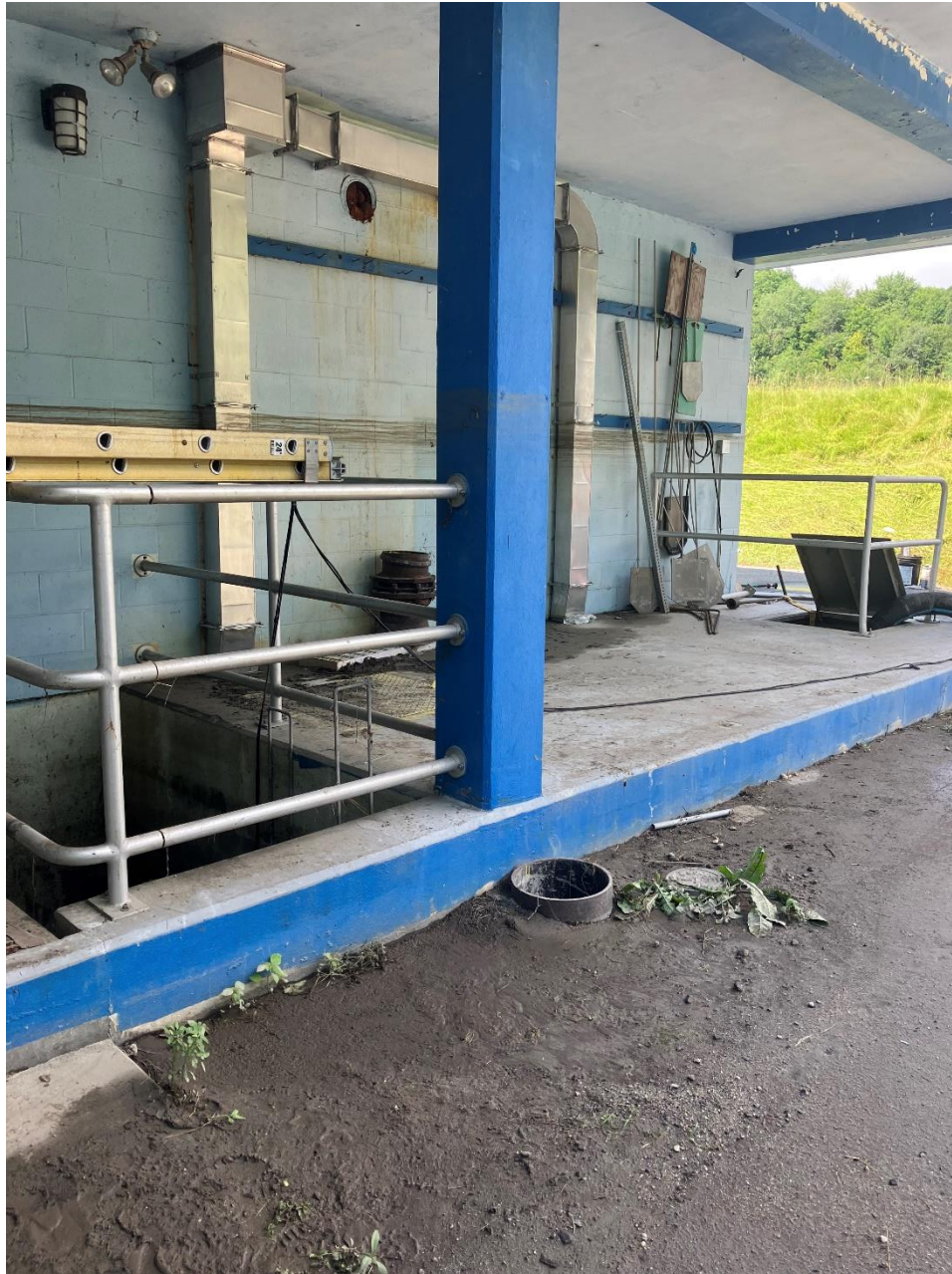
3- High Water Mark Above Grit Chamber and Influent Wet Well