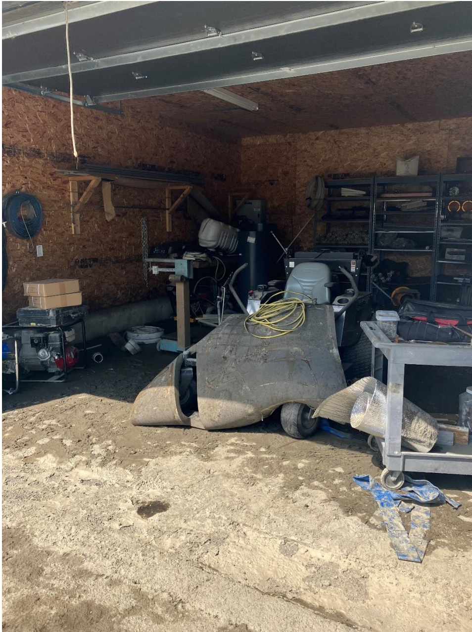
26- Garage Where Lawn Mowing Equipment, Portable Pumps and Hoses, and Spare Parts Were Stored