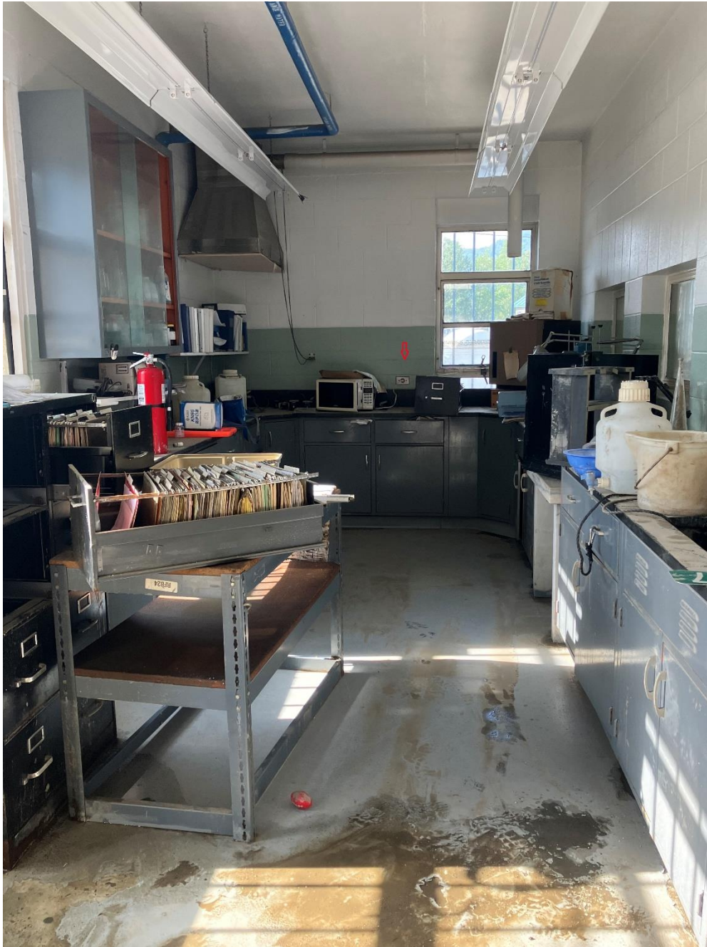
11- High Water Mark in Laboratory Area