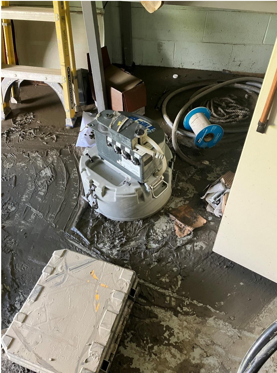
17- Plant Autosampler