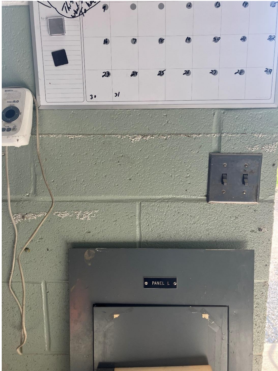
8- High Water Mark with Insulation from Concrete Block Construction in Main Office Area