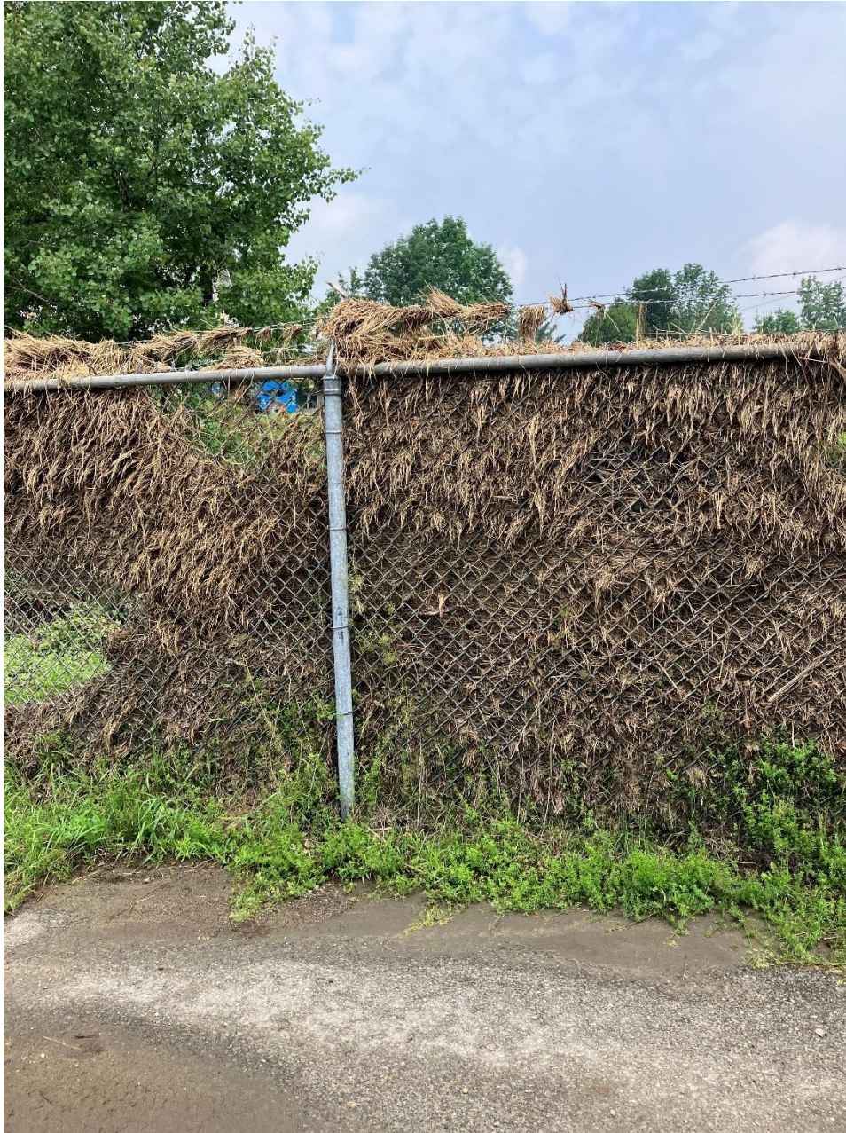
28- Site Fencing