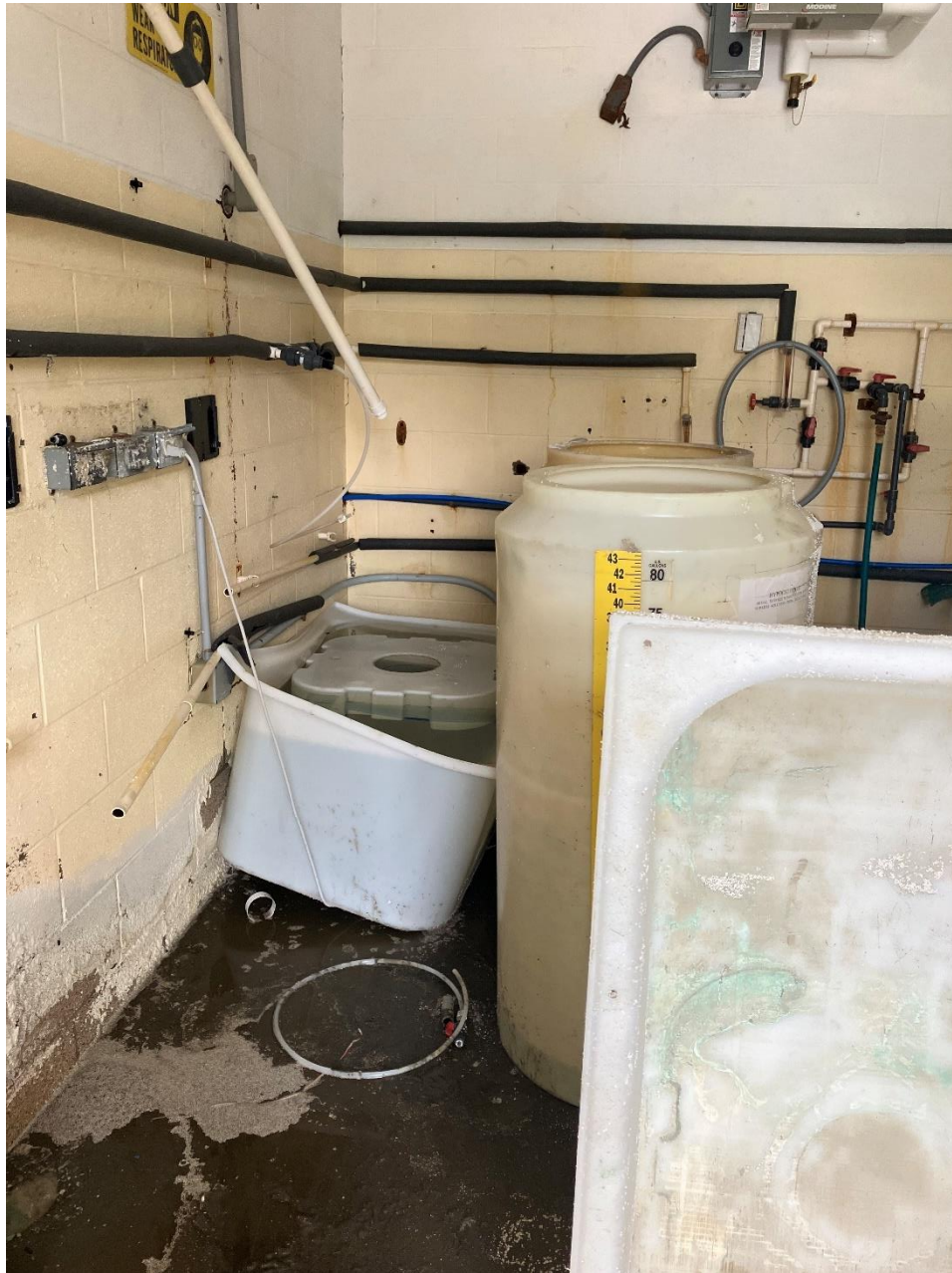
24- Chemical Feed Room with Tanks and Feed Lines