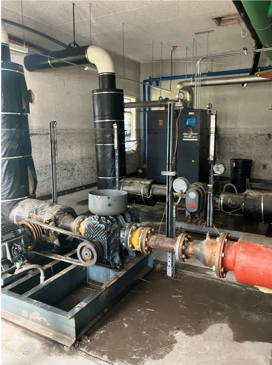
22- Blower Room