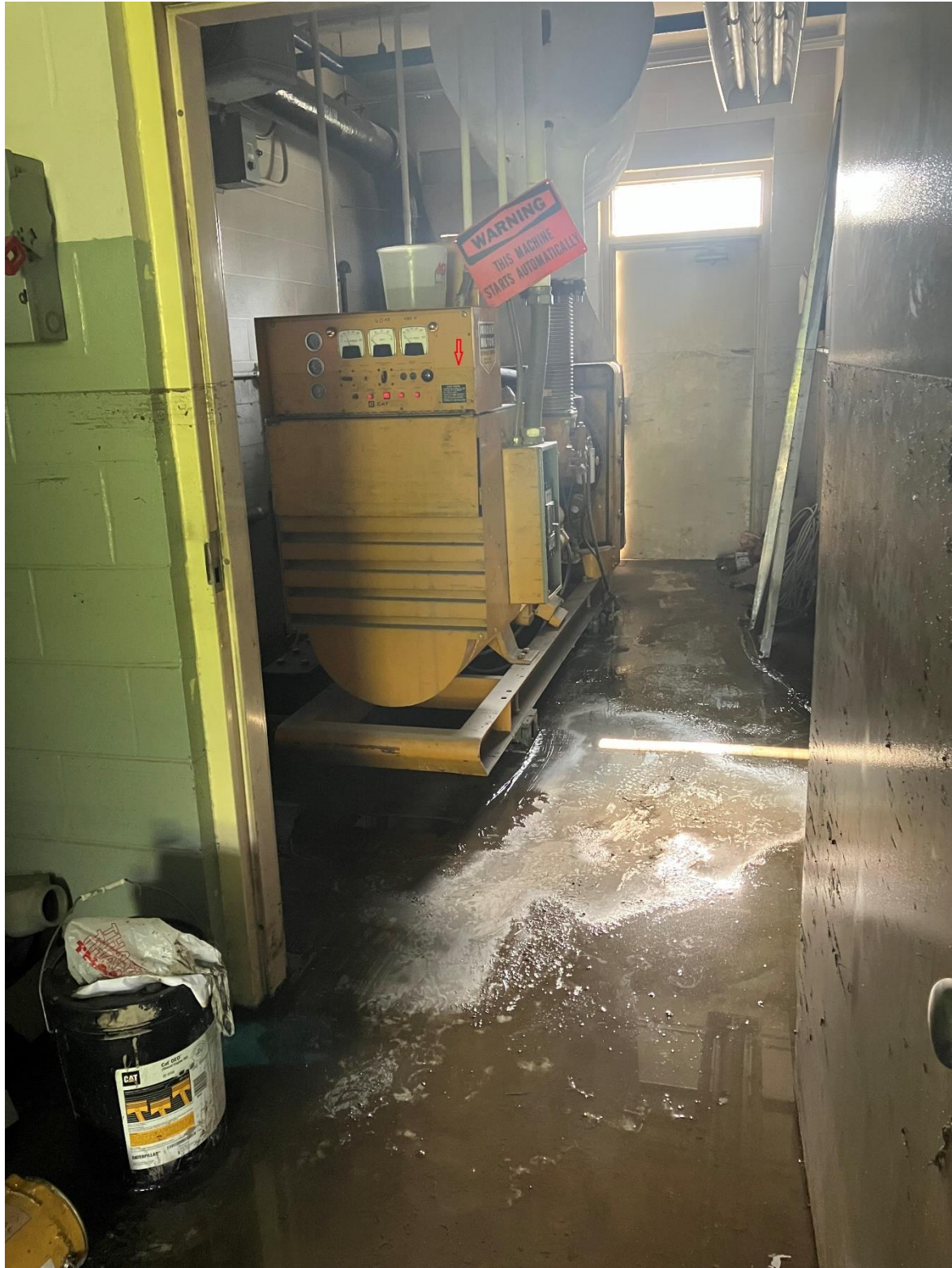
14- Plant Generator High Water Mark