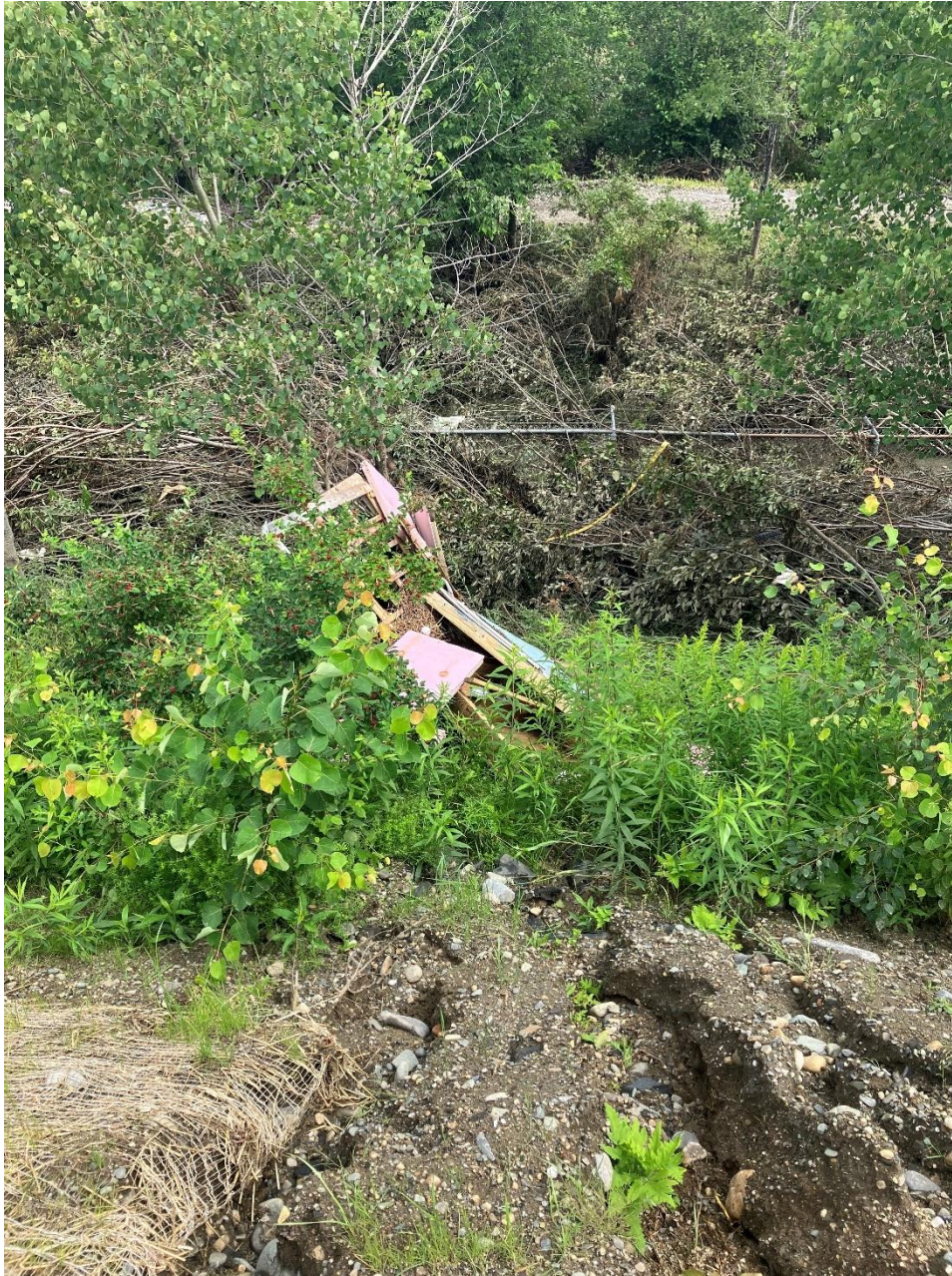
6 – Scour Over Berm of Lagoons and Remnants of Chlorine Injection A-Frame Building Along Site Fencing