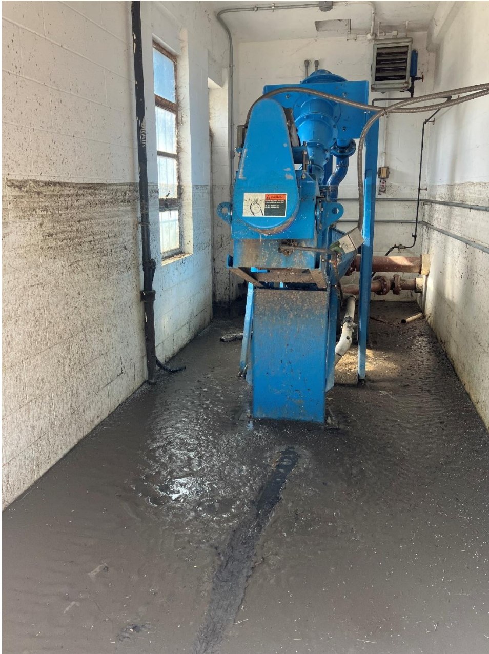
4- High Water Mark in Grit Cyclone Room