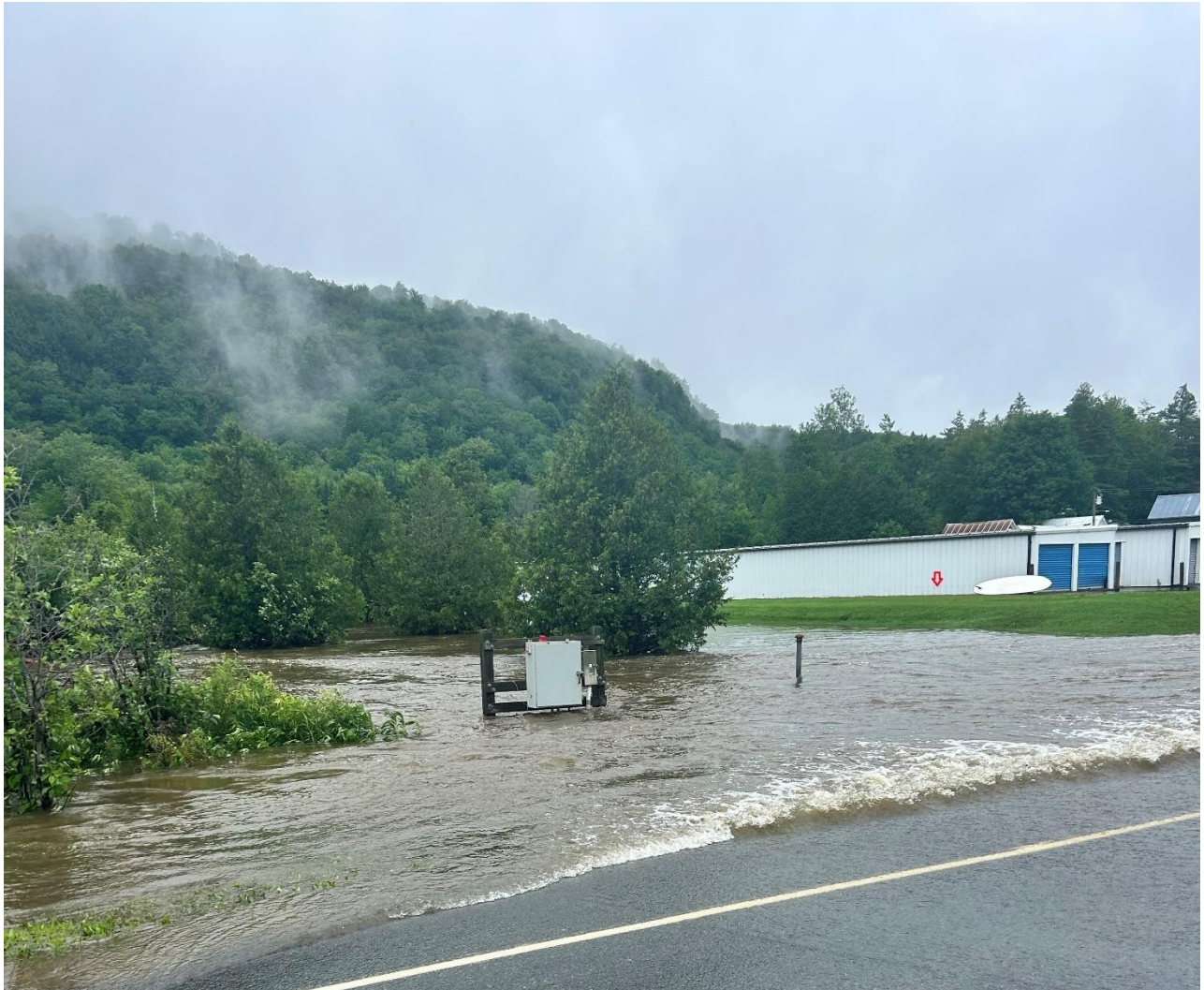
29- Rte. 14 Pump Station After Flood Waters Receded, Note High Water Mark on Adjacent Building