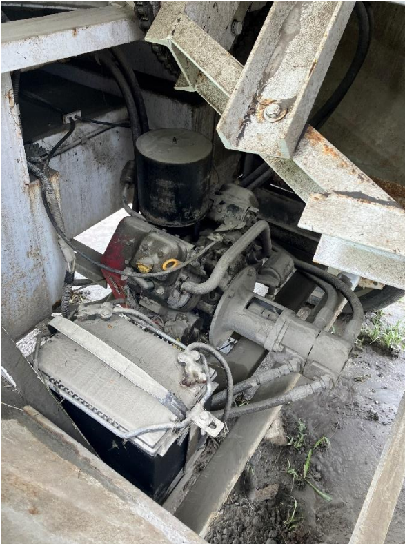
27- Exterior and Interior of Sewer Rodder