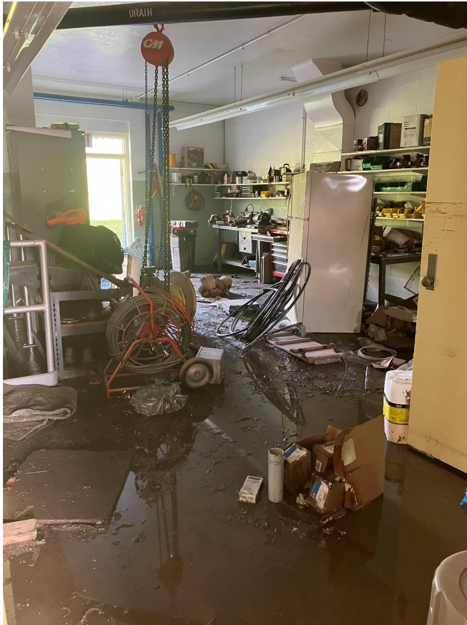
15- Maintenance Room