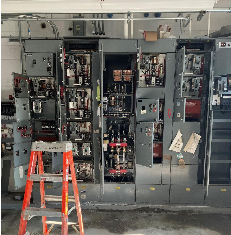
9-Main Building MCC Showing High Water Mark