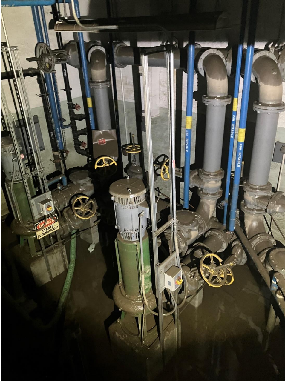
18- Influent Pumps Located in Basement Level