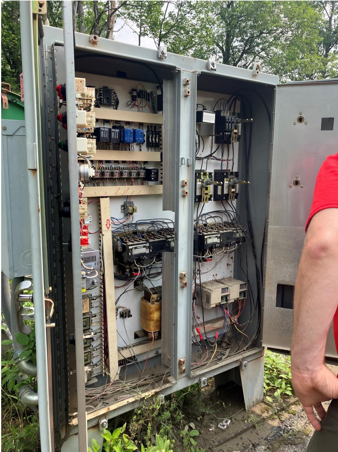
30- Buffalo Street Pump Station Control Panel High Water Mark