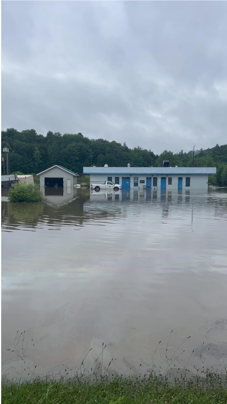
1 – Receded Flood Waters at Main Plant