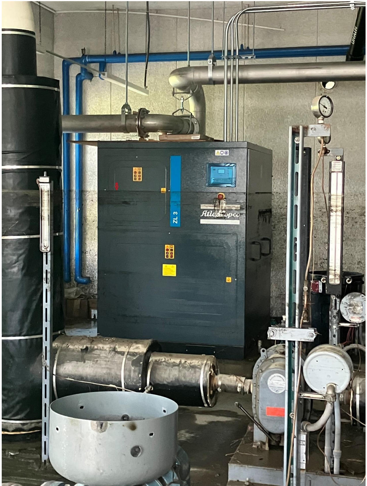
23- New Blower Installed for Improvements Project High Water Mark