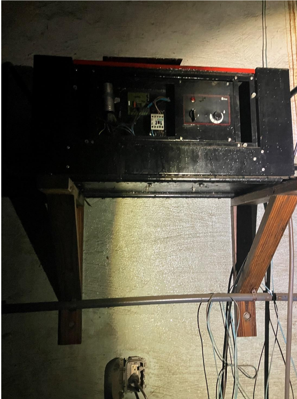
20- Dehumidifier Located in Basement Level