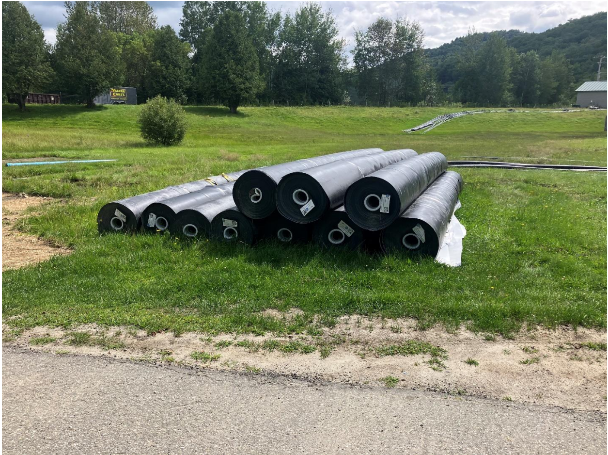
31- Ten (10) Rolls of Lagoon Liner Awaiting Installation for Improvements Project. All Ten Rolls Were Submerged, Several Rolls Were Carried Away by Flood Waters and Retrieved After Flood Waters Receded.