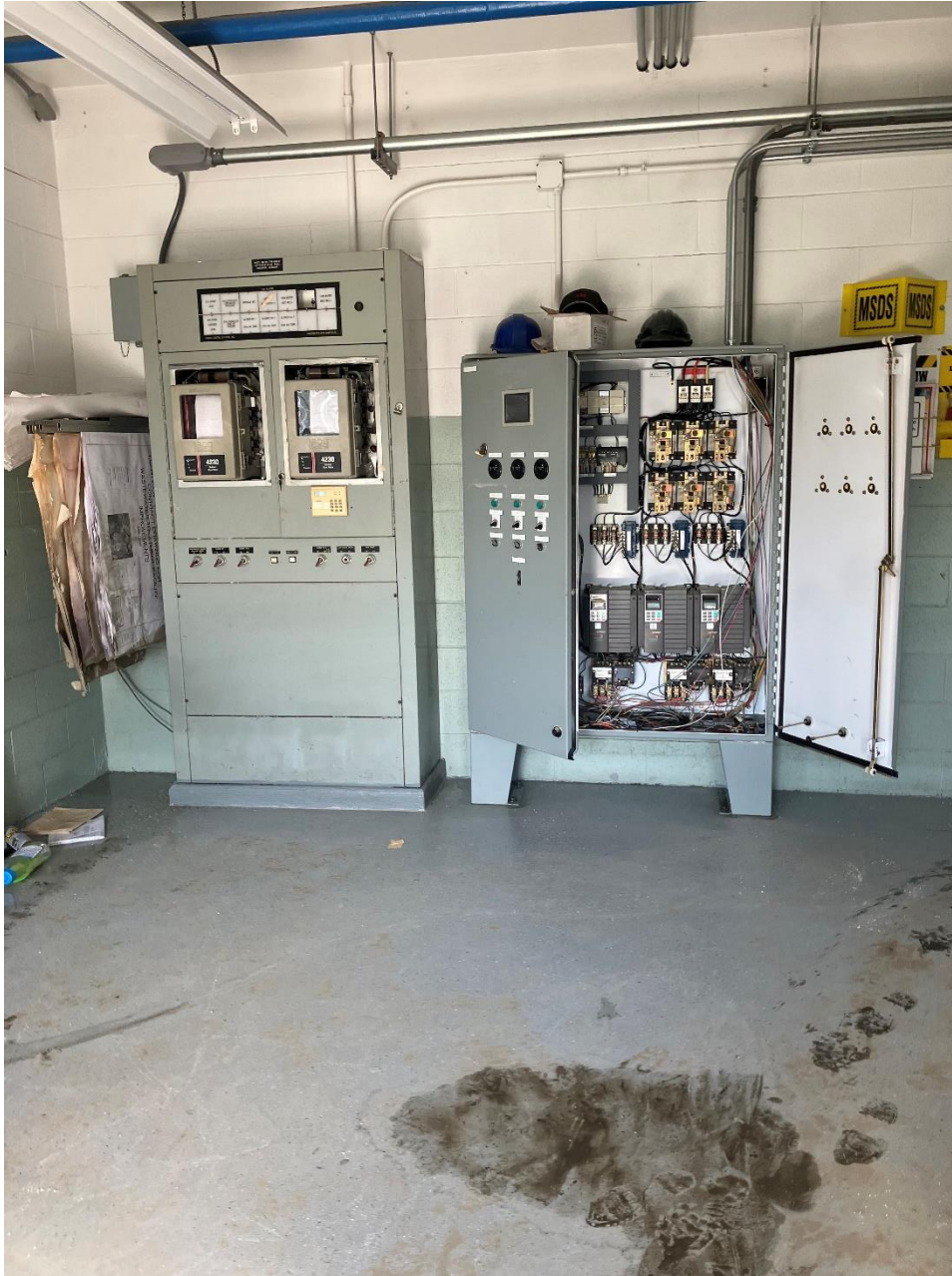
10- Instrumentation and PLC Panel High Water Mark