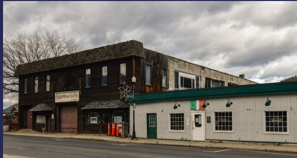
Bellows Falls Garage Windham & Windsor Trust 27 rental units, 19 with subsidies