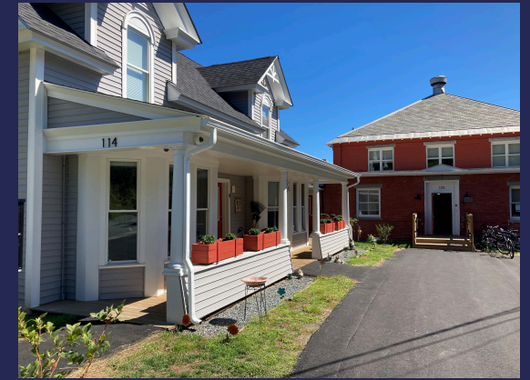
Cherry Street 9 rental units Former Caledonia County Jail St. Johnsbury