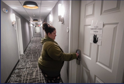
Zephyr Place 72 perpetually affordable apartments Williston