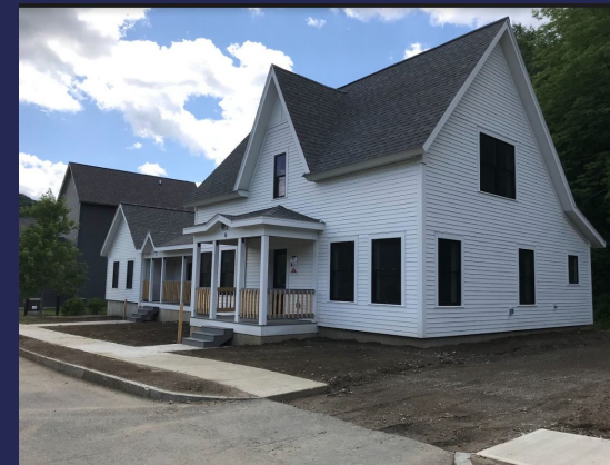
Safford Commons 4 homeownership and 28 rental units with 1 to 3 bedrooms Woodstock