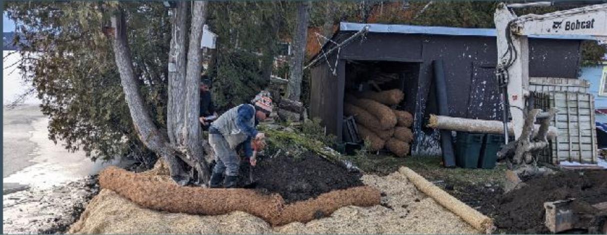
Natural Resources Conservation & Restoration