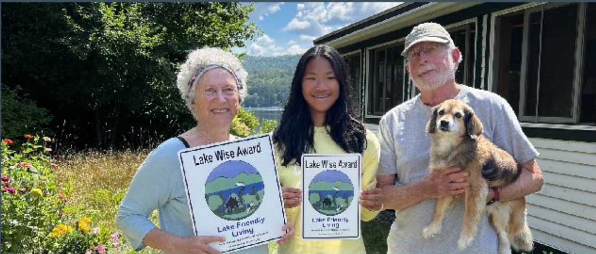
Education & Outreach