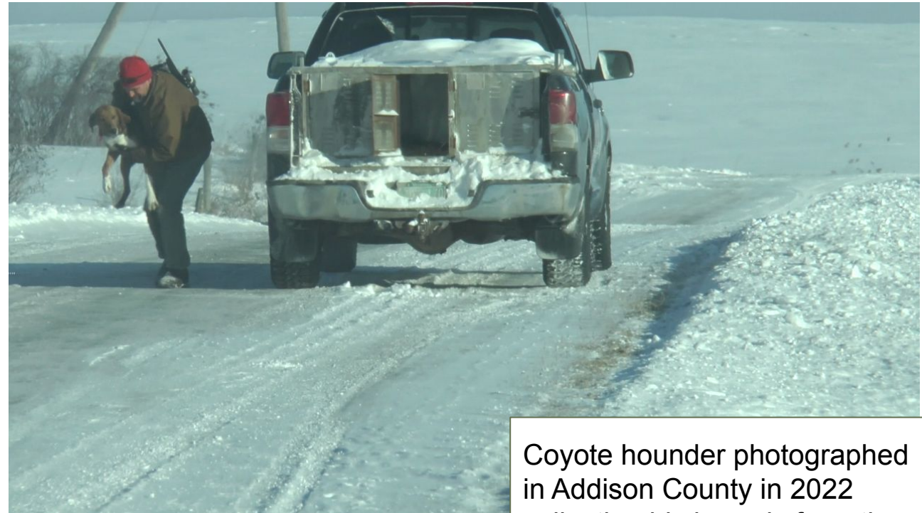
Coyote hounder photographed in Addison County in 2022 collecting his hounds from the road

The General Assembly intends that the rules required under this section support the humane taking of coyote , the management of the population in concert with sound ecological principles , and the development of reasonable and effective means of control .