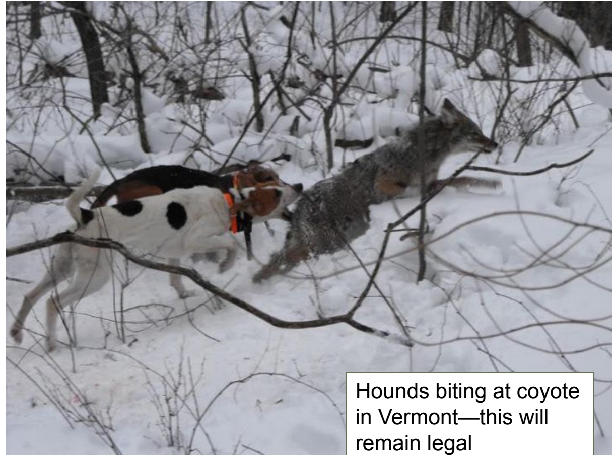
Hounds biting at coyote in Vermont—this will remain legal