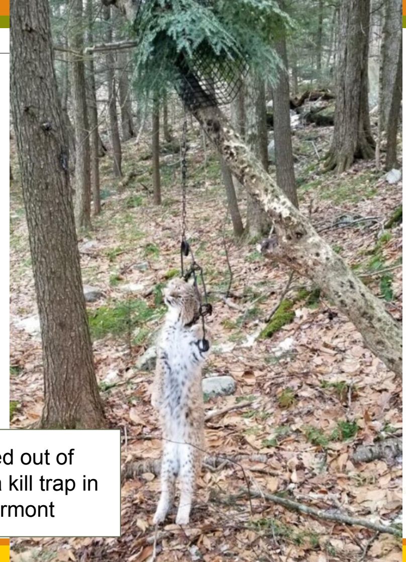
Bobcat killed out of season in a kill trap in Winhall, Vermont

Allowing kill traps on ground and above ground in a tree