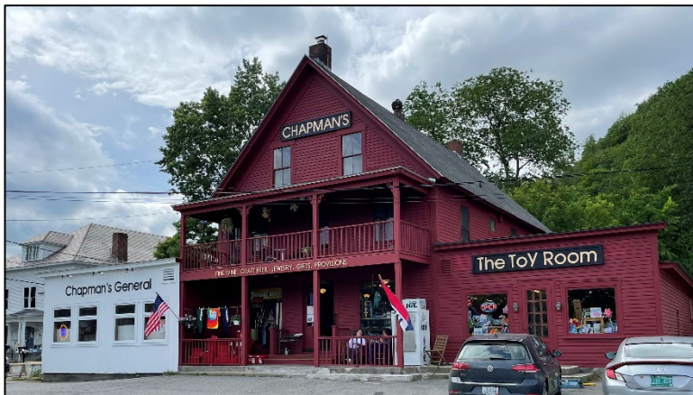
Wallingford Block & Chapman's Store, Fairlee