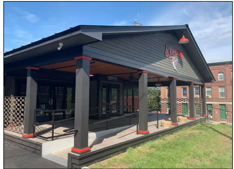
St. Johns Distillery