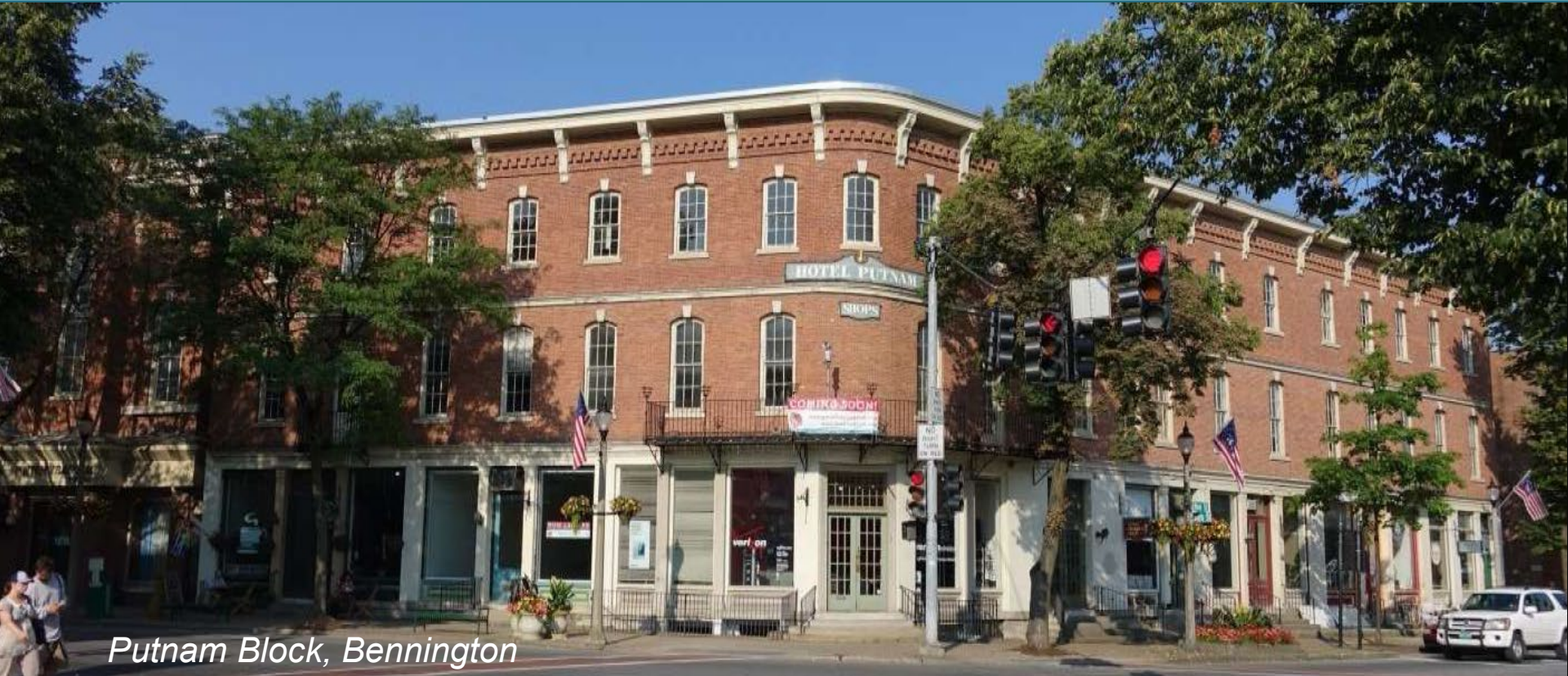
Putnam Block, Bennington