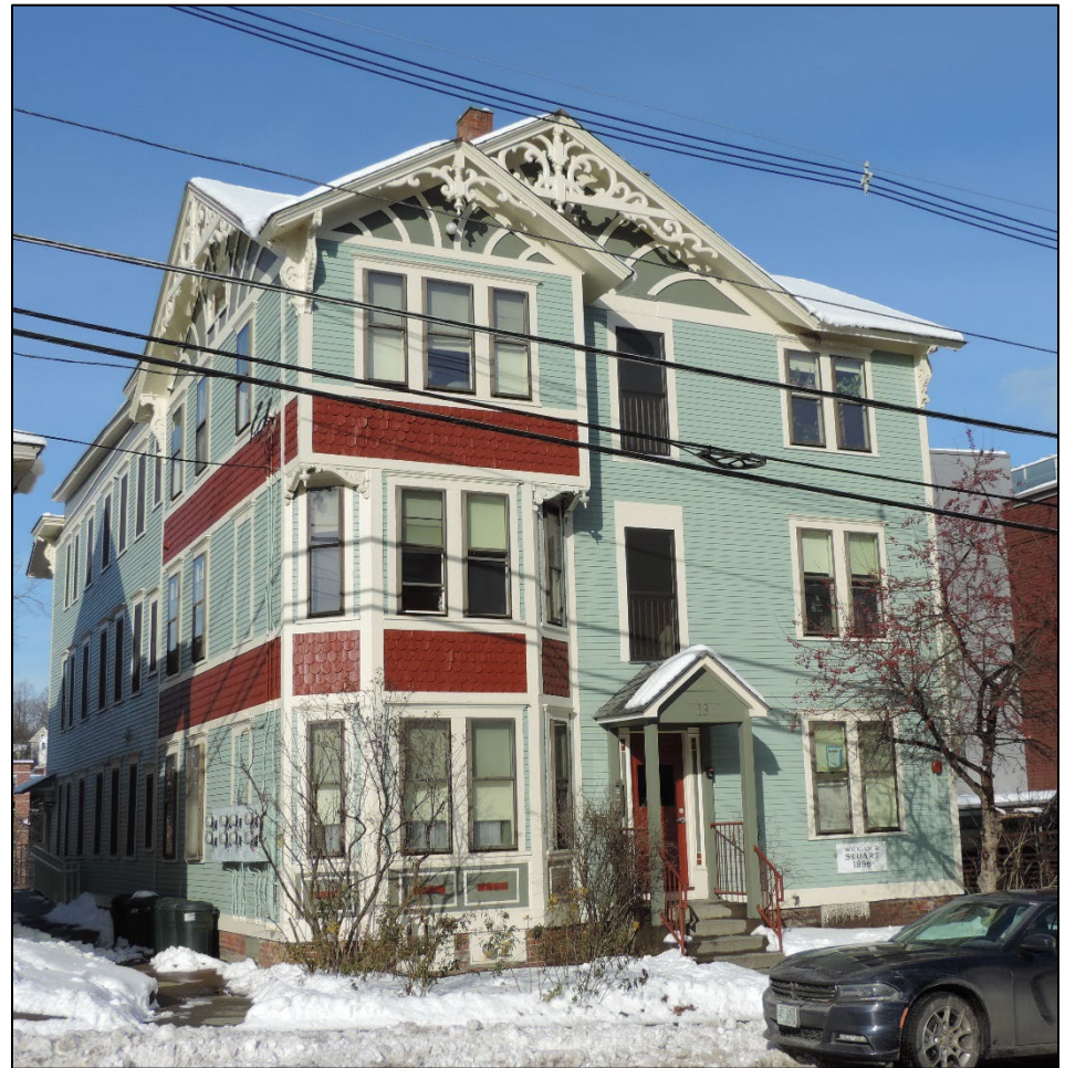
Canal Street, Brattleboro