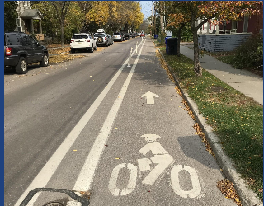
N. Union Street, Burlington