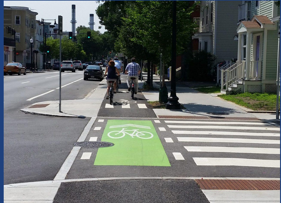
Raised bike lane and crossing in Cambridge, MA