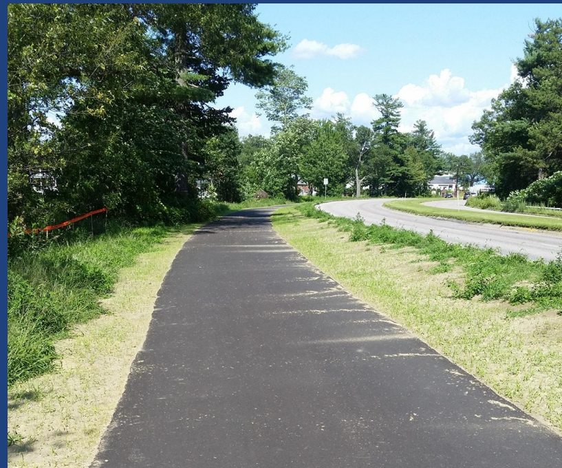
Shared use path along Route 15 in Colchester