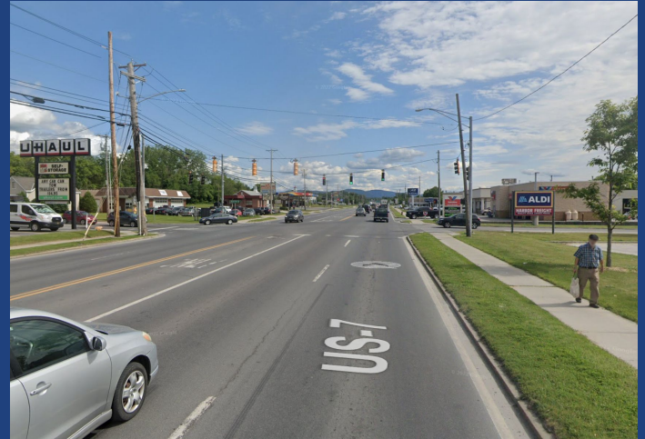
Route 7, Rutland

Two people injured and one killed while walking within a quarter mile of this intersection between February and August 2022.