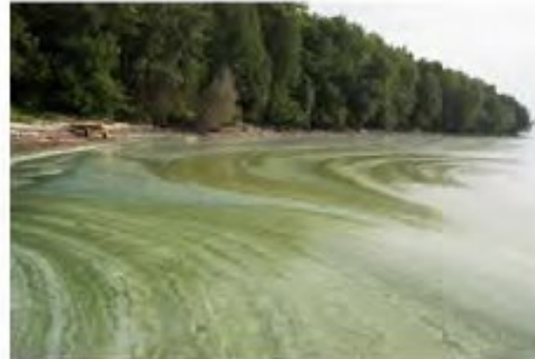
Phosphorus TMDLs for Vermont Segments of Lake Champlain