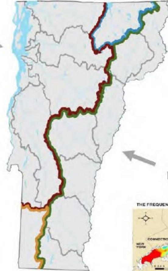
Nitrogen TMDL for Dissolved Oxygen in Long Island Sound