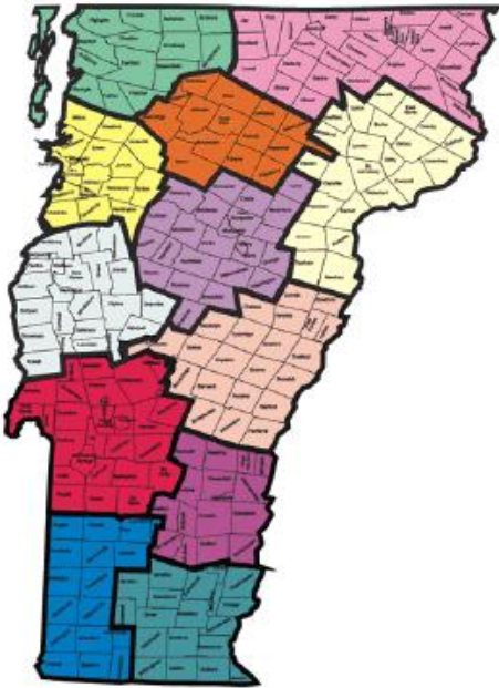
Agency of Human Services Health Districts

The enactment of Act 150 is a huge victory for the Parent Child Center Network. Since the establishment of Parent Child Centers in Vermont statute in the late 1980's, the Network of providers has worked to establish consistency and quality in service delivery for families across the state, and it is significant to have a bill that reflects this new level of formality into statute. Specifically, the Parent Child Center bill proposes to: 1) establish in statute the Parent Child Center Network to ensure accountability among and distribute funding to designated Parent Child Centers; 2) amend the criteria for designation as a Parent Child Center; and 3) require a report on the amount of an annual inflation factor to monies if applied to the base funding appropriated to the Parent Child Center Network. You can read the bill summary here .