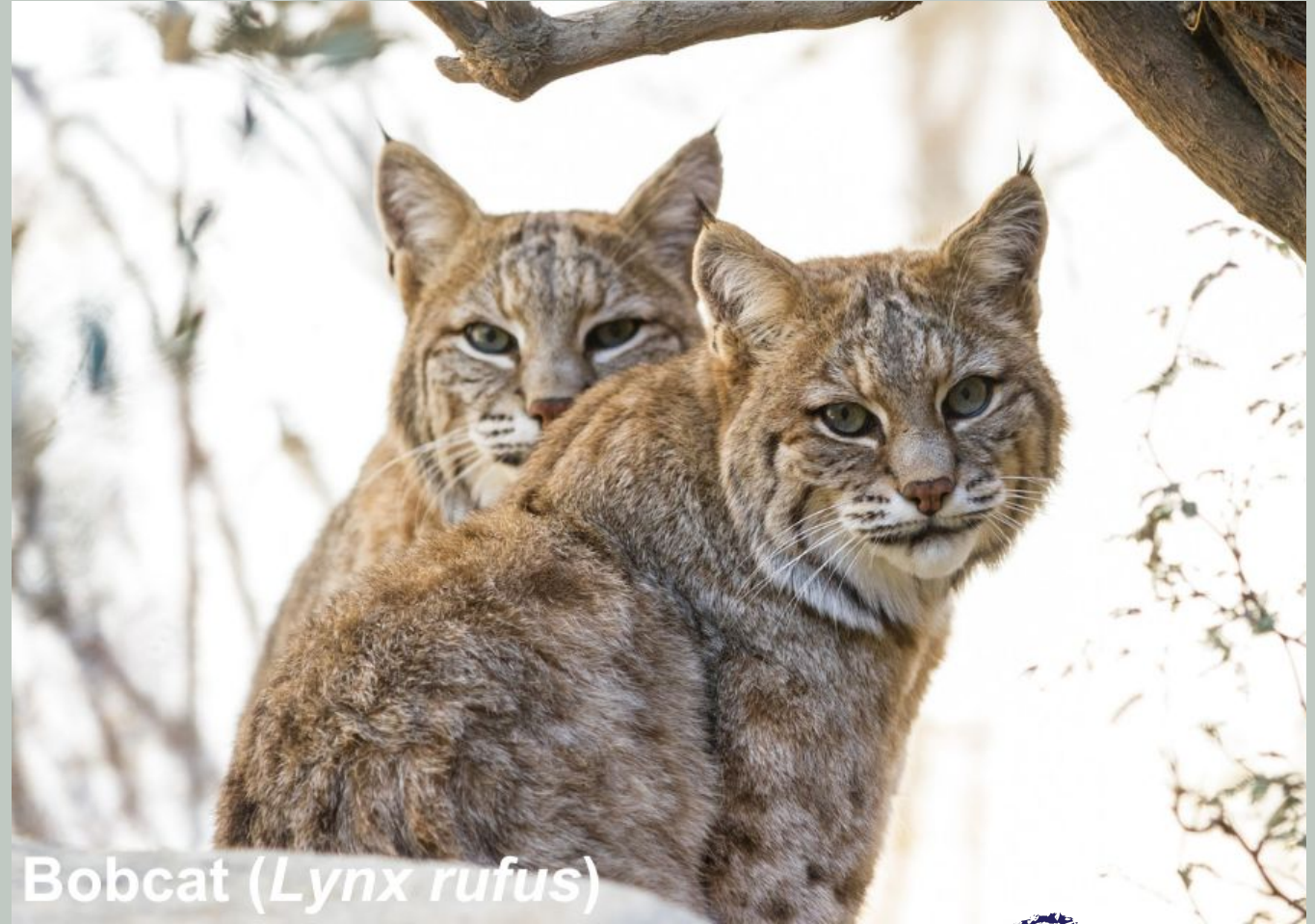
Bobcat ( Lynx rufus )

For future generations, the environment and wildlife