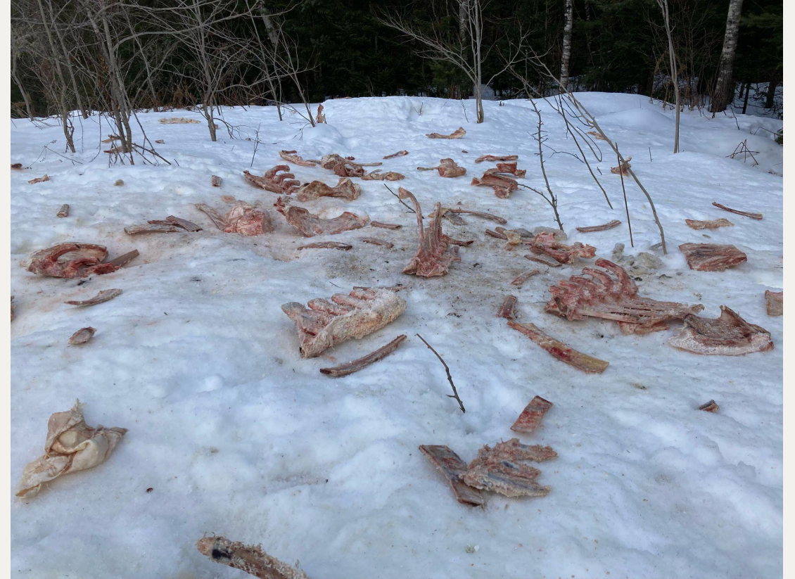
Bait pile: Sutton, VT • Feb 2024

We need to follow the science and stop baiting.