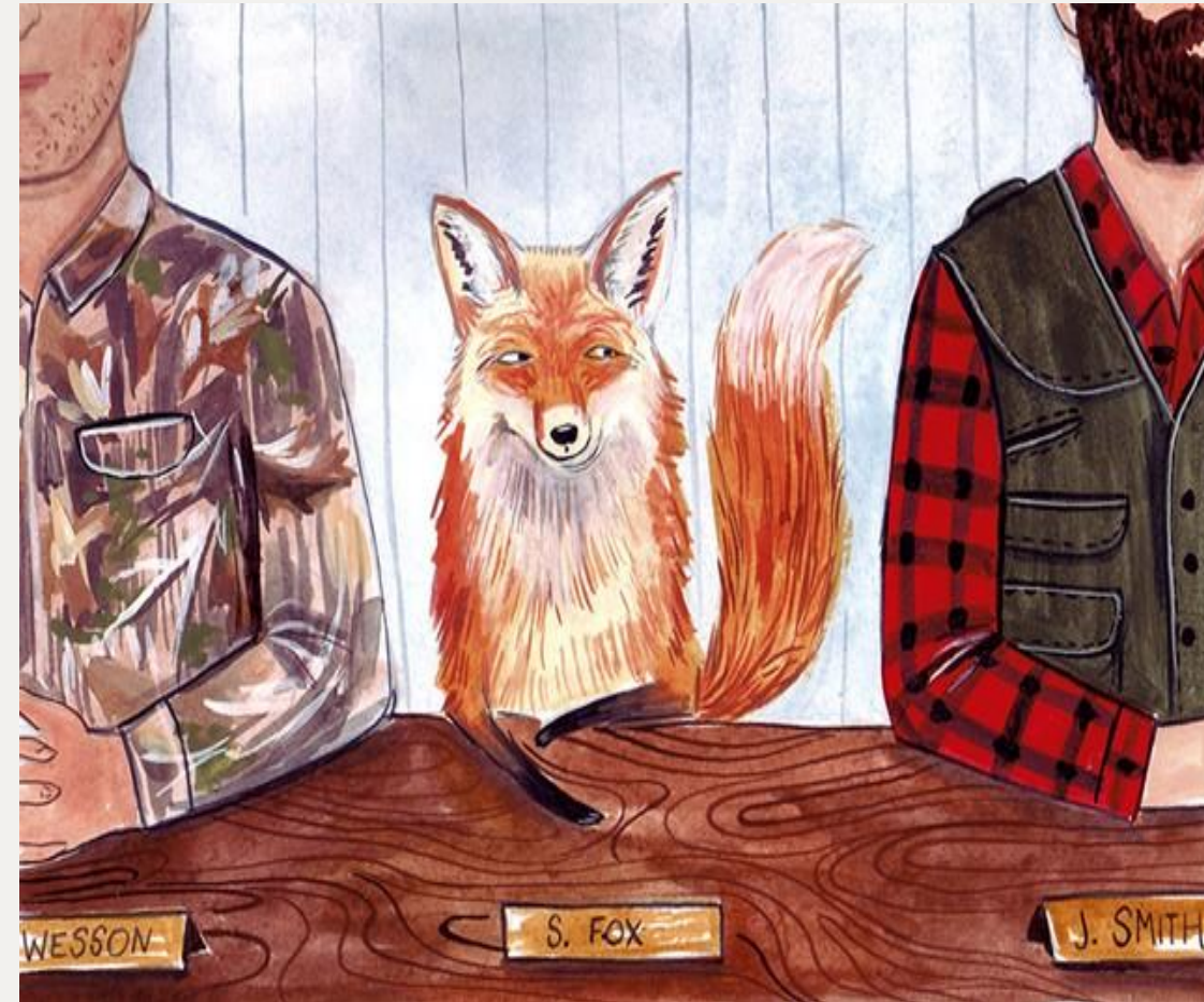
FOX GUARDING THE HENHOUSE