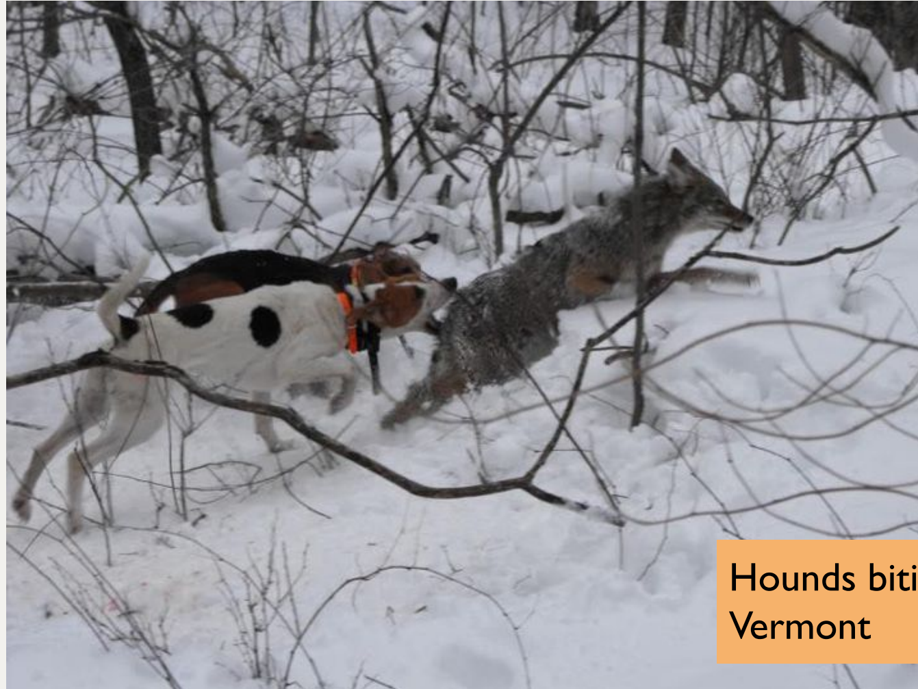
Hounds biting at coyote: Vermont

A recreational activity where large, powerful hounds hunt coyotes while hunters attempt to track the hounds on GPS from their vehicles. There is no control of hounds that are running a mile or more away from the hounder by merely wearing a GPS and shock collar.