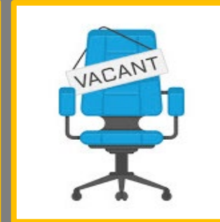
S/O User Support Specialist