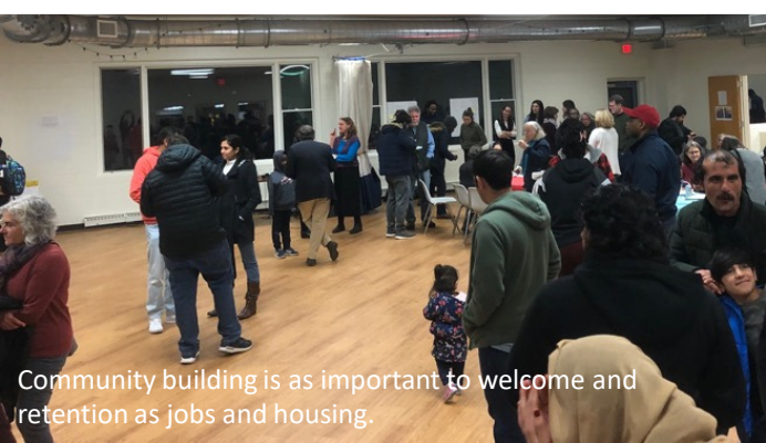
Community building is as important to welcome and retention as jobs and housing.