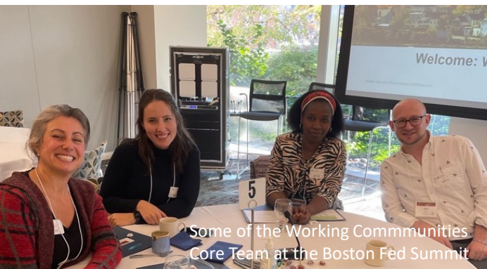
Some of the Working Communities Core Team at the Boston Fed Summit