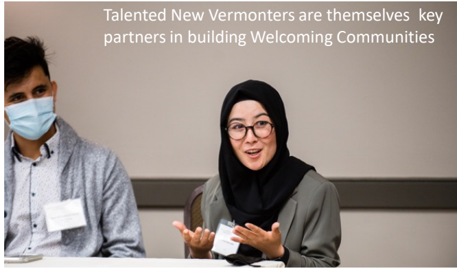
Talented New Vermonters are themselves key partners in building Welcoming Communities