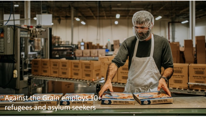
Against the Grain employs 10+ refugees and asylum seekers