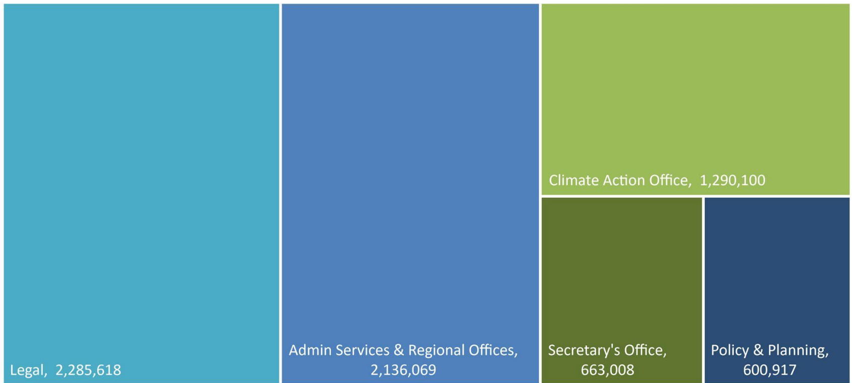
FY 2024 Overview of the Secretary's Office Programs