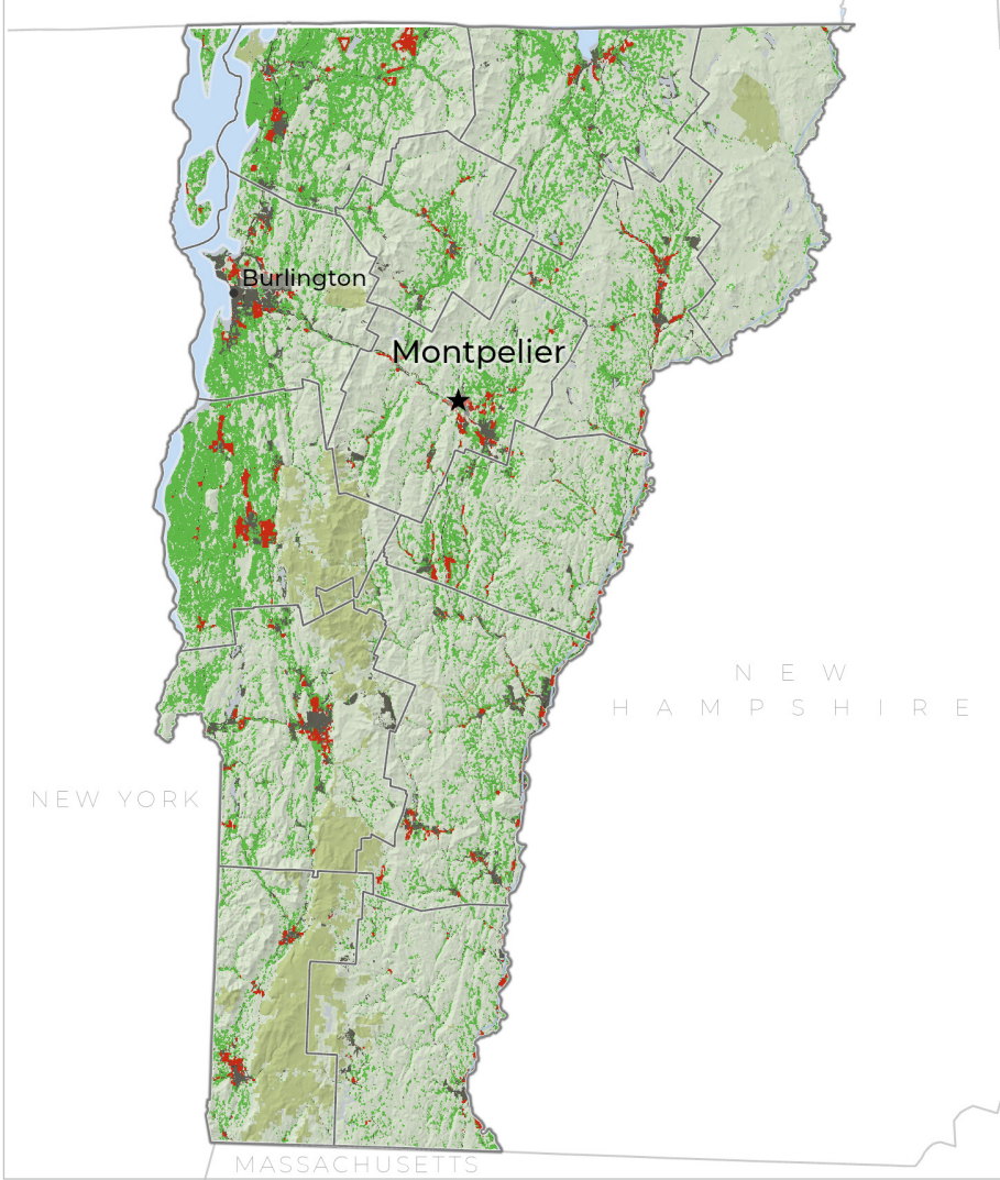
Projected agricultural land conversion from 2016-2040 in the Business as Usual scenario.