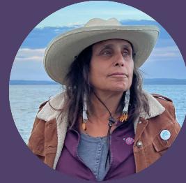
Keynote Speaker Winona LaDuke