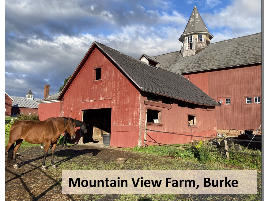
Mountain View Farm, Burke