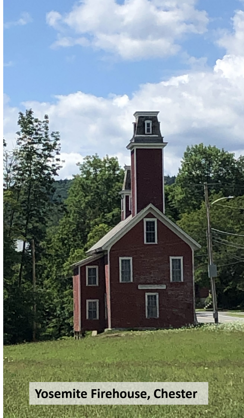
Yosemite Firehouse, Chester