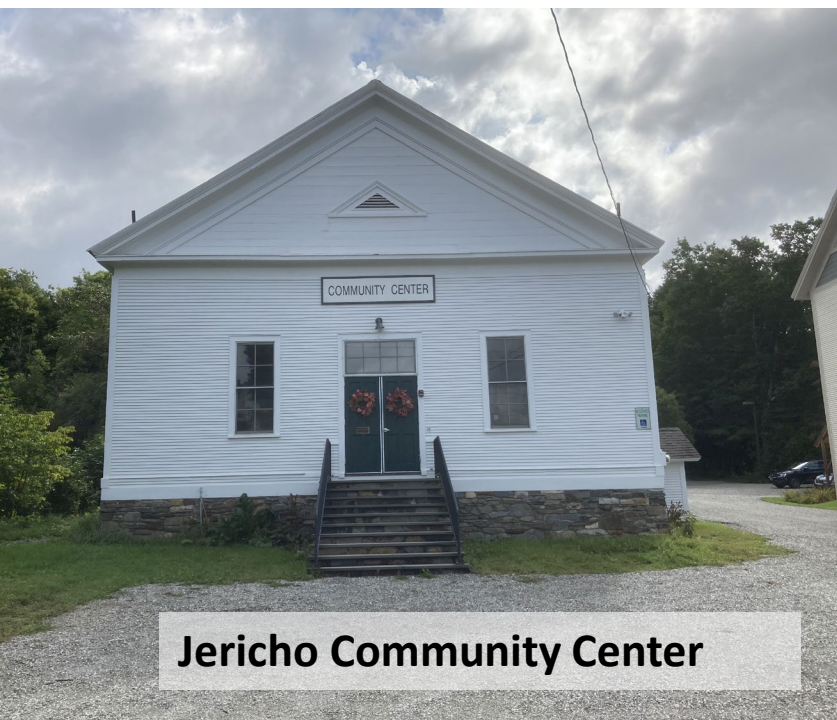
Jericho Community Center