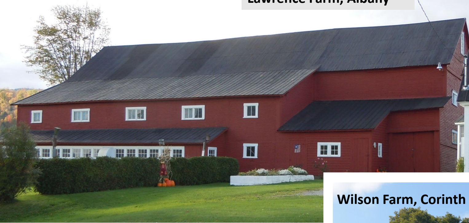
Lawrence Farm, Albany