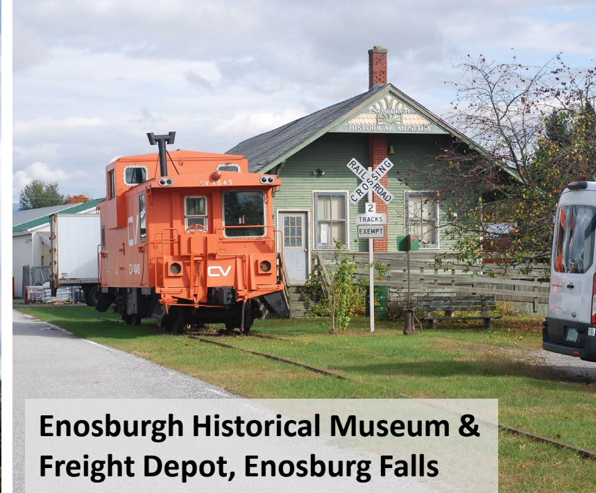
Enosburgh Historical Museum & Freight Depot, Enosburgh Falls