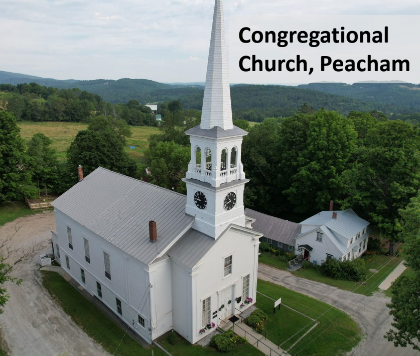
Congregational Church, Peacham