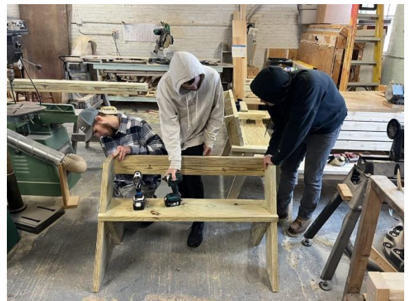
Youth Build participants learning basic carpentry skills by building benches for local nonprofit organizations. Youth Build is located in Barre and Burlington VT.