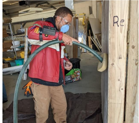
A participant learns how to blow cellulose insulation during the Weatherization 101 Intensive in Barre, VT during the October 2022 session.

We are proud of the accomplishments above and are grateful for the continued support from the State of Vermont. We have the momentum to meet or exceed all of the specific goals set in our grant agreement. As we enter the next phase of this collaboration, with an increased focus on systems building and resource development, we are demonstrating that paid learning-service opportunities are part of the broad systemic change that needs to occur in Vermont. Together we are addresses a nexus of challenges facing our workers, communities, and climate.