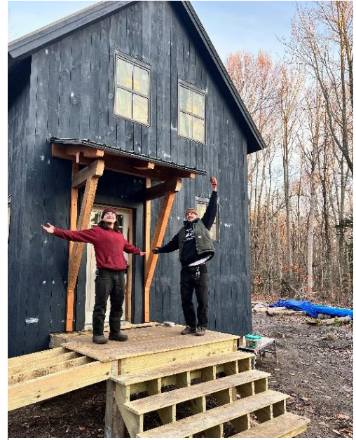
Celebrating at the entrance to the completed Grout Pond Hut!