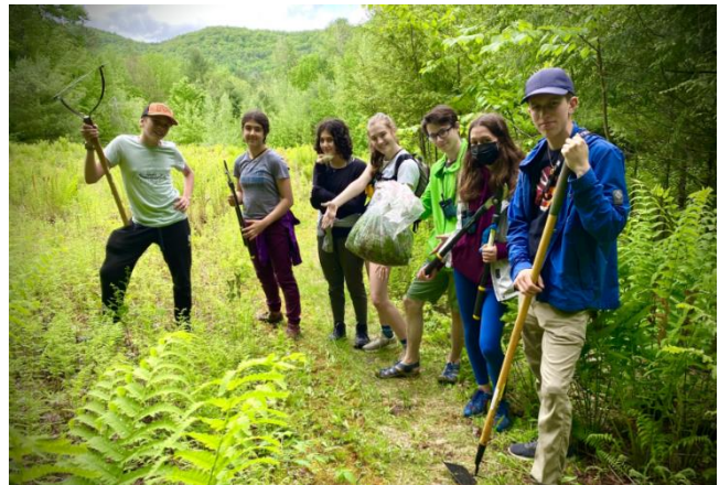
Junior Conservation Techs with tools to help manage trails at the Audubon Center.