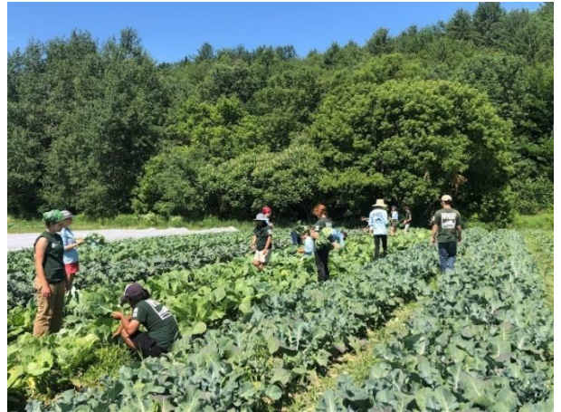
VYCC Crews hard at work harvesting rows and rows of leafy greens!

Feedback from VYCC Health Care Share Recipient: "It has dramatically increased our vegetable intake and made me more mindful of what I'm feeding myself and my family. It also helped us stretch our food budget further."