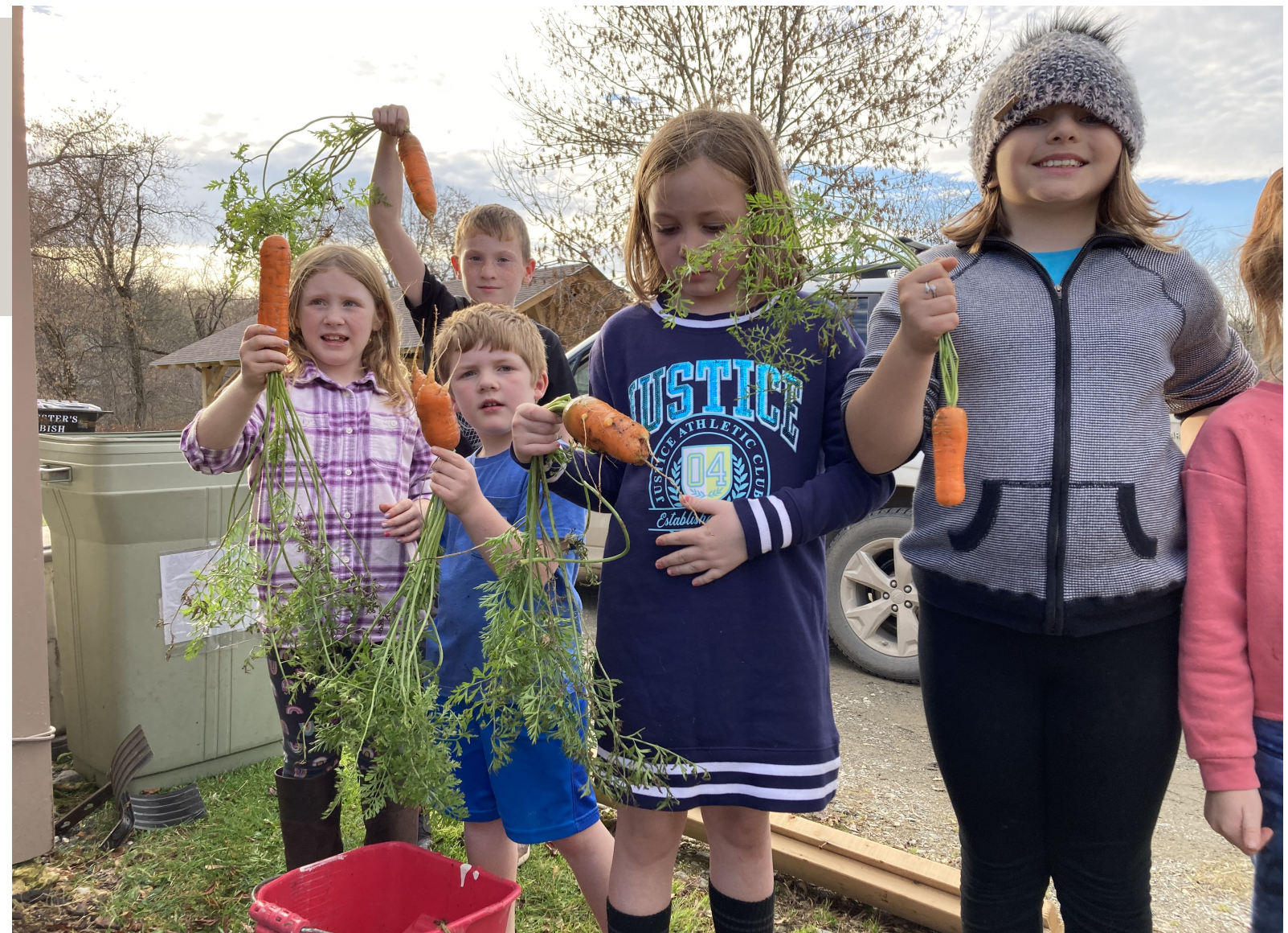
After school students displaying their carrot harvest at the Fairfield Community Center in Fall 2022.

This spring, 2023, the grantee is gearing up to connect elementary school students and migrant farm workers through the Huertas gardening project. Huertas is a community-based food security project that enables Latino/a migrant farmworkers and families living on Vermont's dairies to access culturally familiar and local foods through cultivating kitchen gardens.