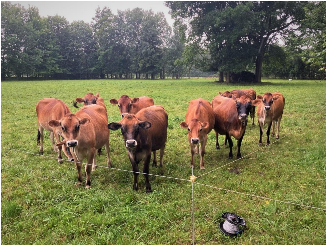
A herd of rotationally grazing Jersey cows in the Otter Creek Watershed. Rotational grazing is a conservation practice supported by the Farm Agronomic Practices Program and the Pasture and Surface Water Fencing Program.

Submitted by Vermont Agency of Agriculture, Food and Markets January 13, 2023