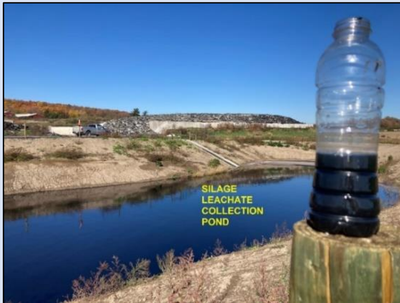
The expanded Waste Storage Facility collecting and storing silage leachate and nutrient runoff from the farm. The water bottle shows an up-close look at silage leachate being collected.

Woodnotch Farms completed a liquid Waste Storage Facility project with joint funding from the Natural Resources Conservation Service's Environmental Quality Incentives Program (EQIP) and VAAFMs BMP program. Woodnotch Farm's old, vegetated treatment system for silage leachate was allowing the high flow storm runoff to distribute to a small Vegetated Treatment Area where it was becoming overloaded with nutrients. Additionally, the low flow tank was not able to hold all the leachate, causing it to overflow toward nearby waters. With the help of the two programs, Woodnotch Farms was able to expand their Waste Storage Facility so it can now hold all the silage leachate and contaminated runoff from the feed bunk complex.