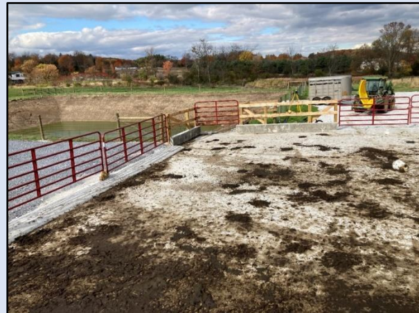
Before (left) and after (right) of a heavy use area and waste storage facility project in the Otter Creek watershed.

A next generation dairyman recently purchased his organic Jersey cow dairy from his father and the farm was due for upgrades to their waste management infrastructure. The cows' winter barnyard was damaged beyond repair, solid manure was being stacked in the adjacent eroded field, waste runoff was not being contained, and an old in-ground milkhouse waste system was failing and draining to a nearby wetland. Over the course of two years and two grants, the BMP program installed a new pump station for milkhouse waste, a new concrete barnyard and a gravel manure stacking area, all of which are now directed to a new earthen manure lagoon. The farm was additionally able to leverage funds from a VHC Water Quality grant to help fund a concurrent barn improvement.