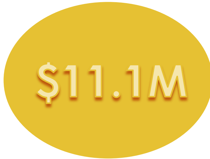
FFY23 FEDERAL SUPPLEMENTAL GRANTS