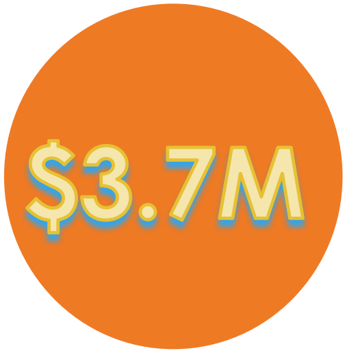
FFY23 FEDERAL BASE GRANT