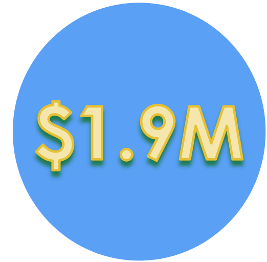
STATE MATCH SFY23 CW (Base and Supplemental via IIJA)