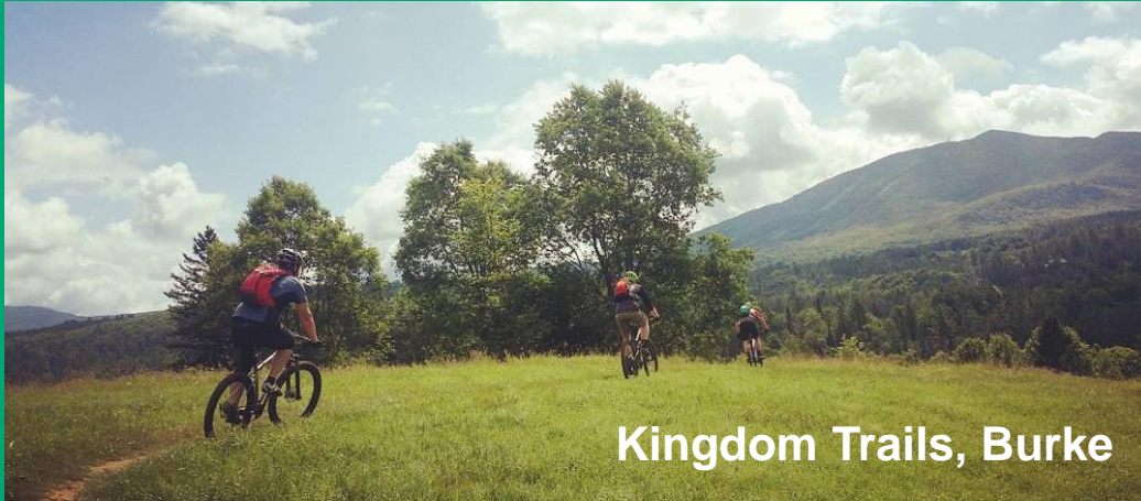
Kingdom Trails, Burke