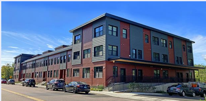
Butternut Grove Condominiums, Winooski