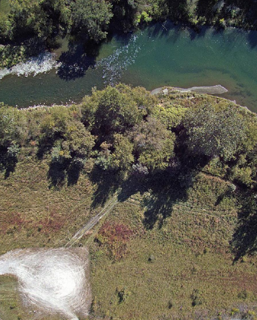
The Recreation Area on the Hoosic River, Pownal Trails Association/Empower Pownal