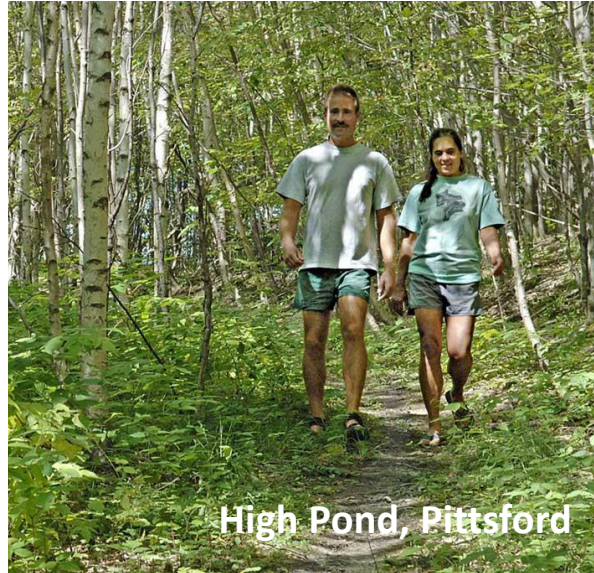
High Pond, Pittsford