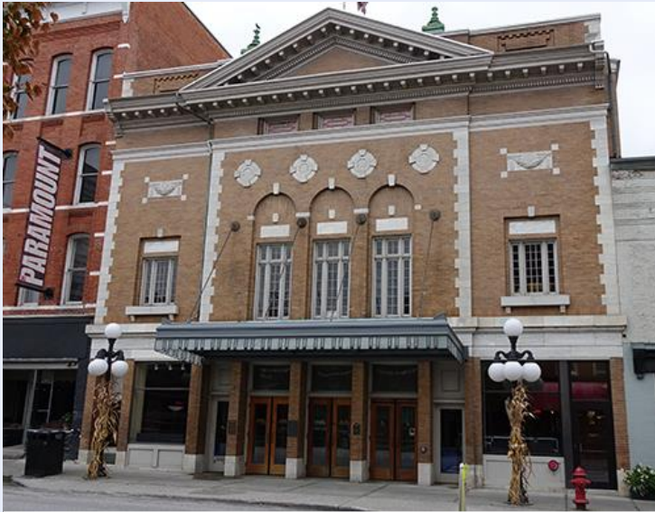
Paramount Theater, Rutland