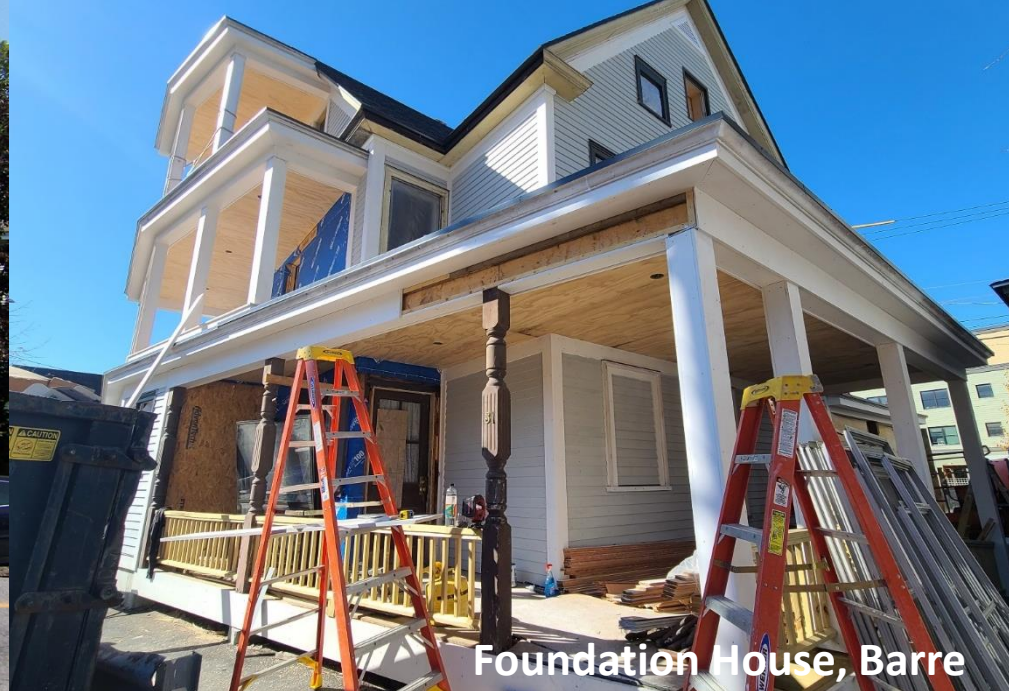
Foundation House, Barre