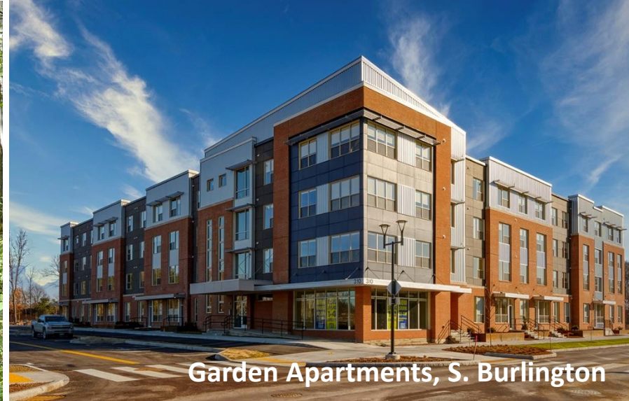
Garden Apartments, S. Burlington