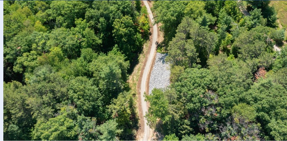
Newport Bike Path Bridge, completed in 2022 with support from REDI