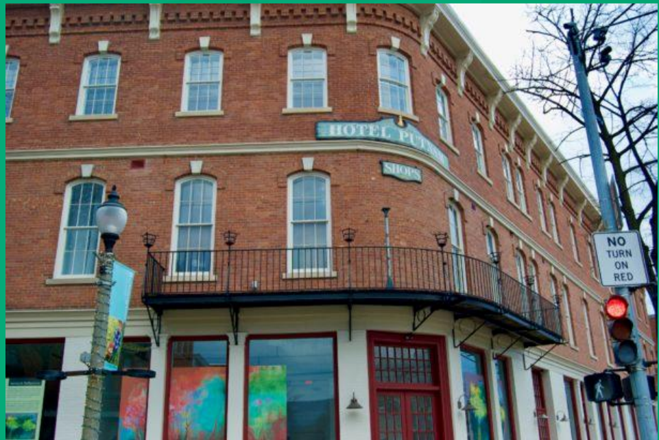
Putnam Block, Bennington