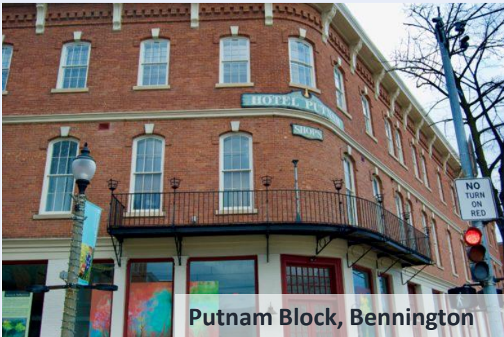
Putnam Block, Bennington

VHCB investments keep downtowns vibrant, from performing arts theaters to restoration of historic blocks with commercial on the ground floor and housing on the upper stories.