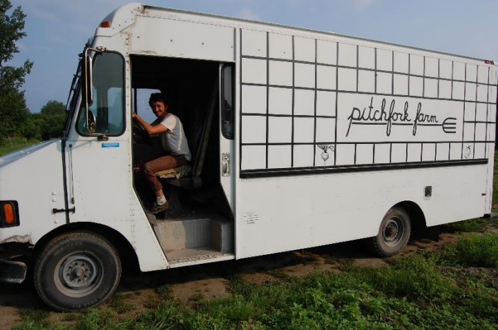
Diggers Mirth Collective Farm and Pitchfork Farm, located at the Intervale, have completed business planning and received grants to implement their plans