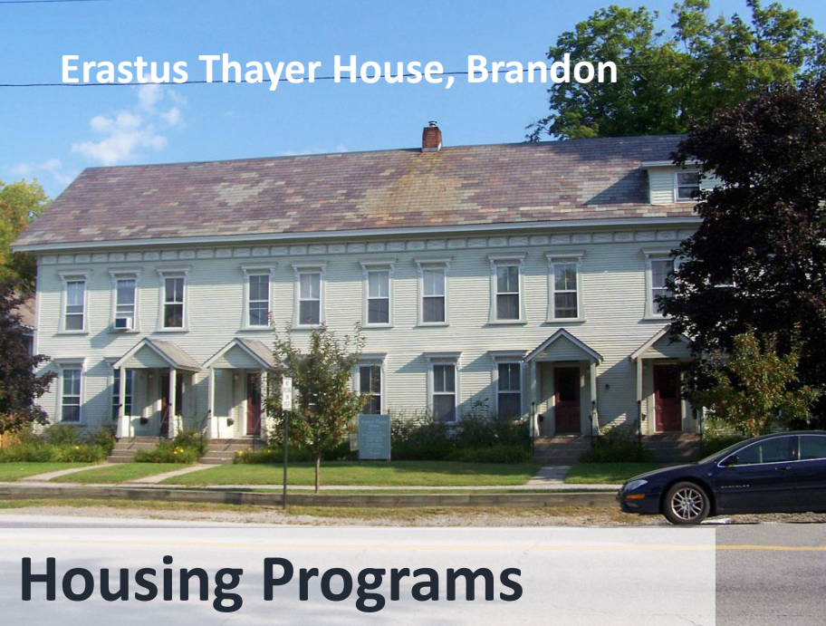
Erastus Thayer House, Brandon