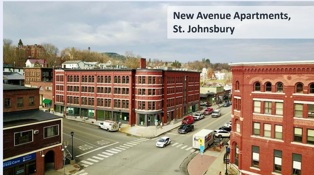
New Avenue Apartments, St. Johnsbury

VHCB investments keep downtowns vibrant, from performing arts theaters to restoration of historic blocks with commercial on the ground floor and housing on the upper stories.