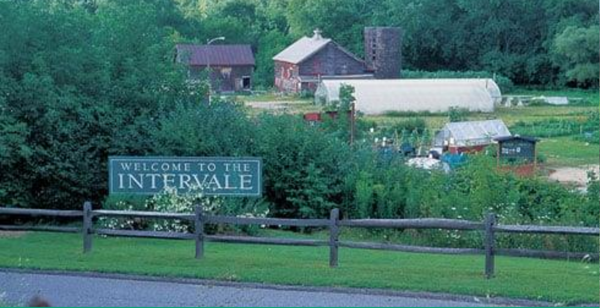
The entrance to the Intervale, which hosts community events, trails, and dozens of farm businesses