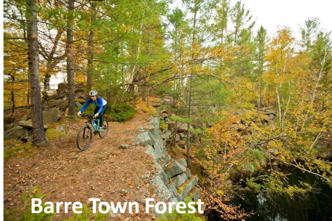
Barre Town Forest