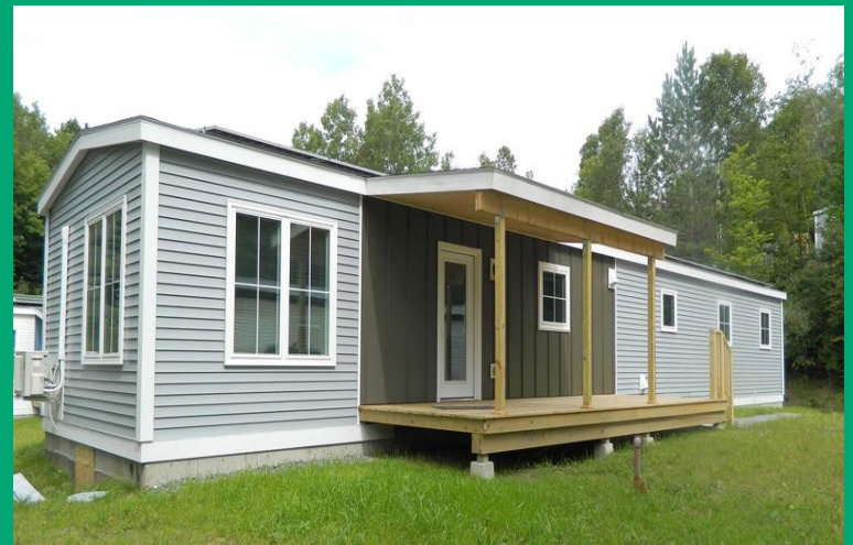
Net-Zero modular home in Hardwick