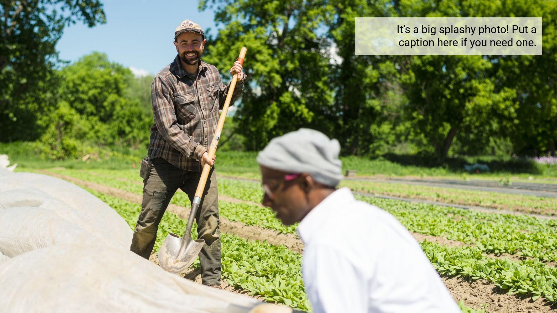
It's a big splashy photo! Put a caption here if you need one.